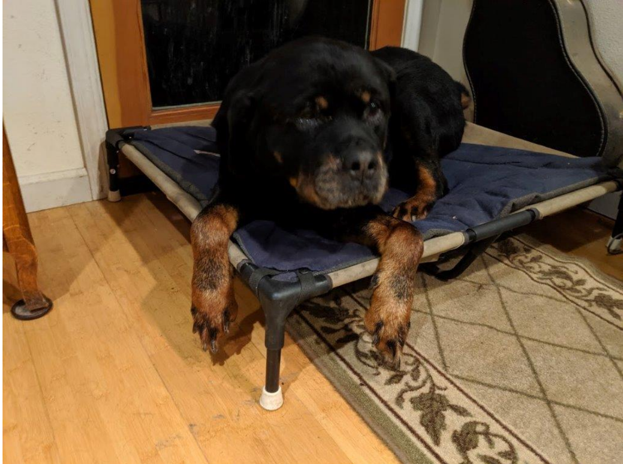
Figure 1: Did Somebody Say Squirrel?