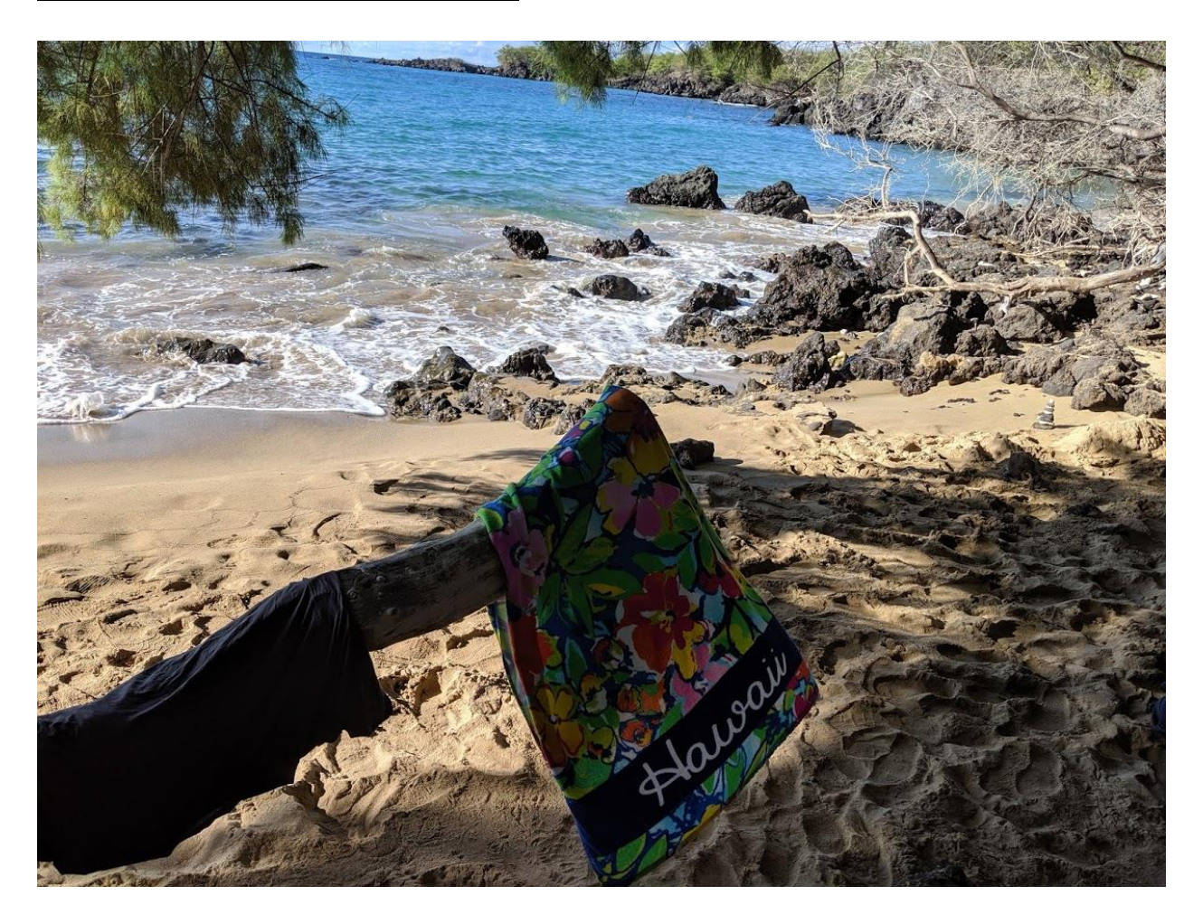
Figure 1: Not a Squirrel