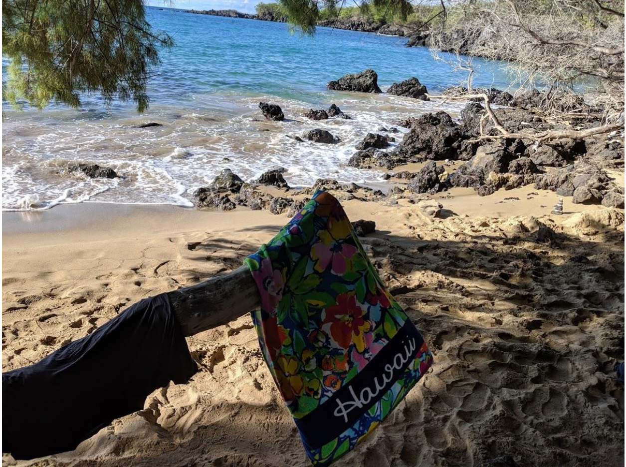
Figure 1: Not a Squirrel