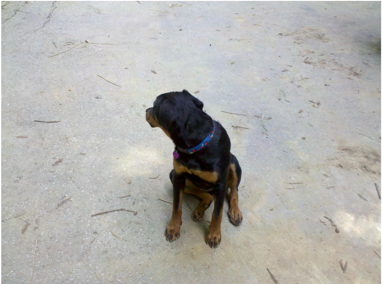
Figure 1: Squirrel?