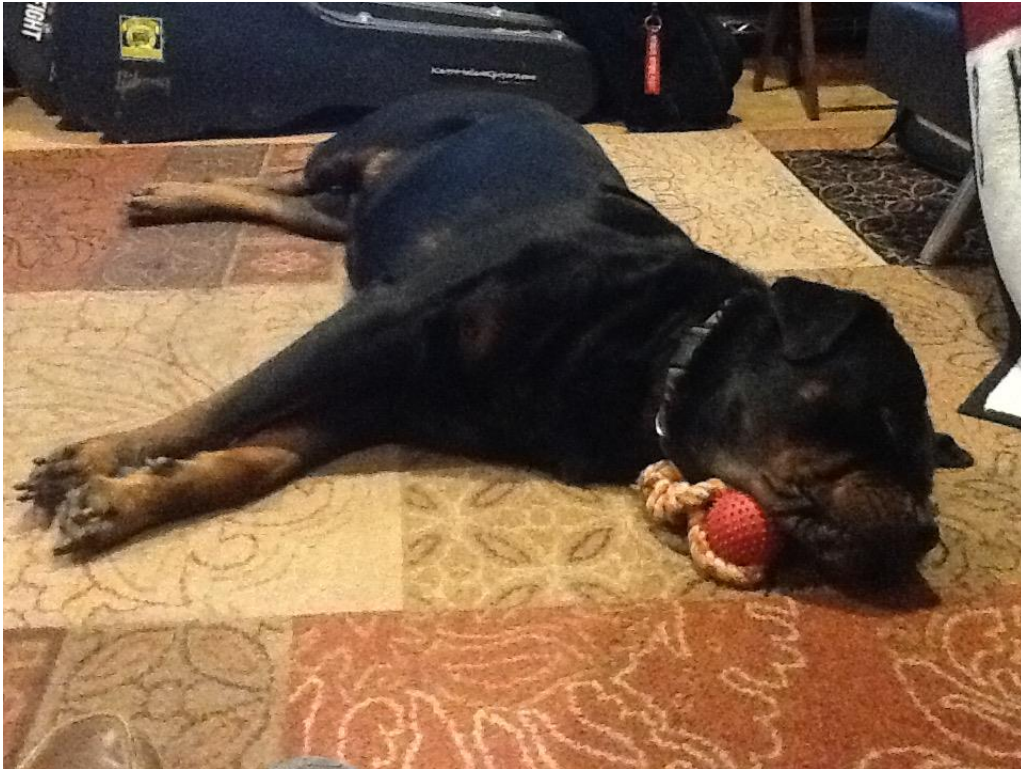
Figure 1: Spring is almost here!