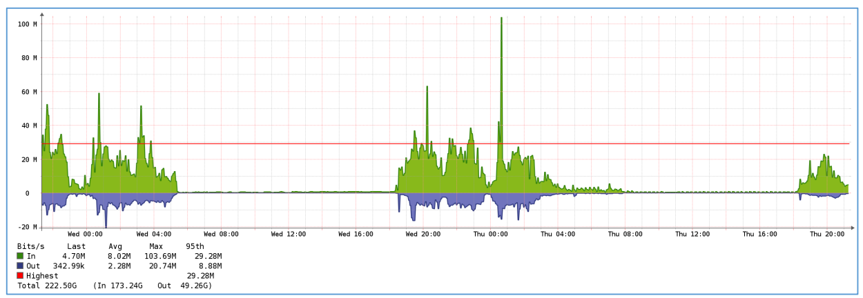
Figure 5. External Bandwidth: past 48 hours