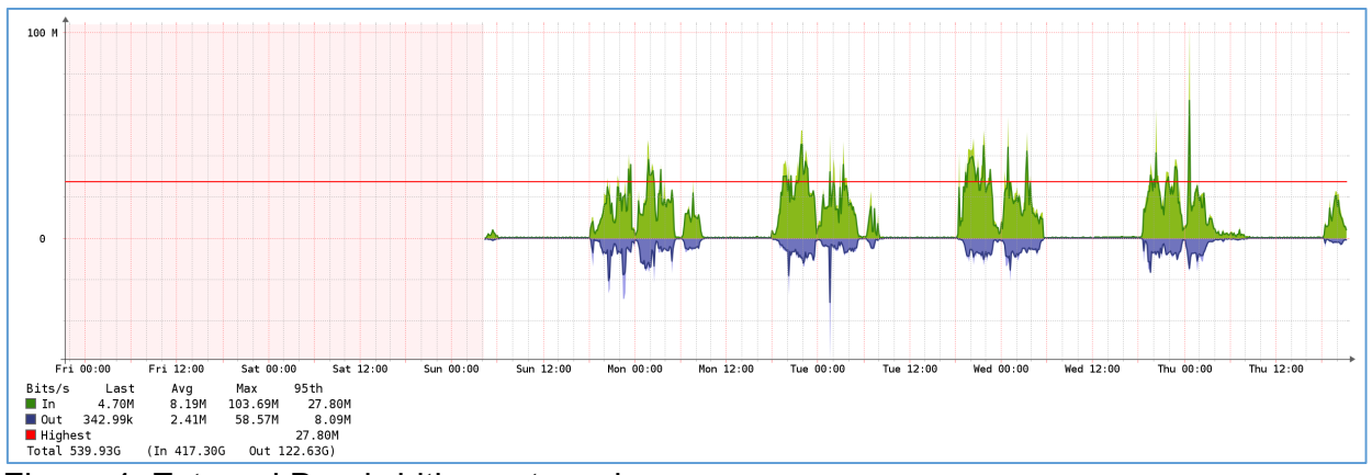
Figure 4. External Bandwidth: past week