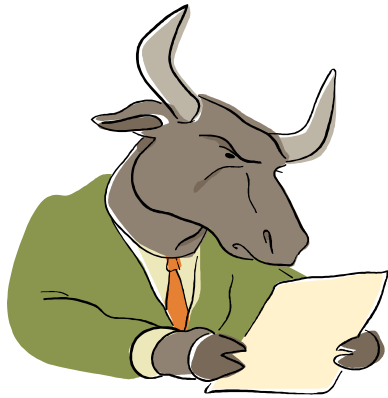
Broad Market Potential