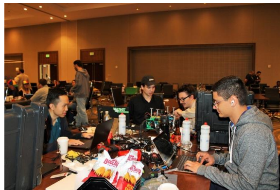
Prepping the gear...