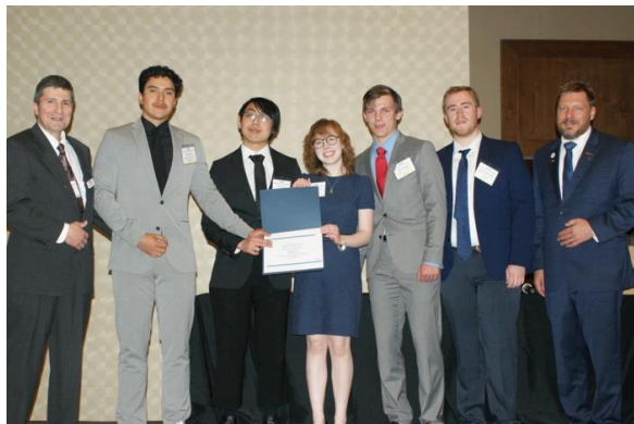
Third place, Round 2, went to the team from the Missouri University of Science and Technology.