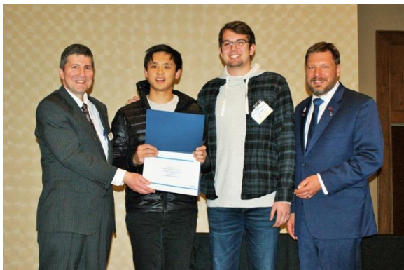
And first place went to the team from the South Dakota School of Mines.