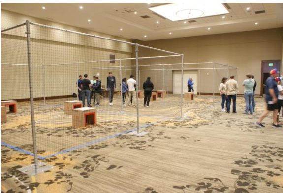
The field of competition...