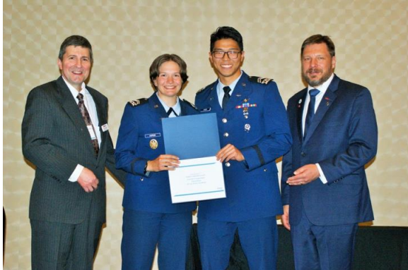
Third place went to the US Air Force Academy team.