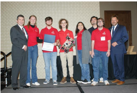
Third place, Round 1, went to the RIOT@UARK from the University of Arkansas.