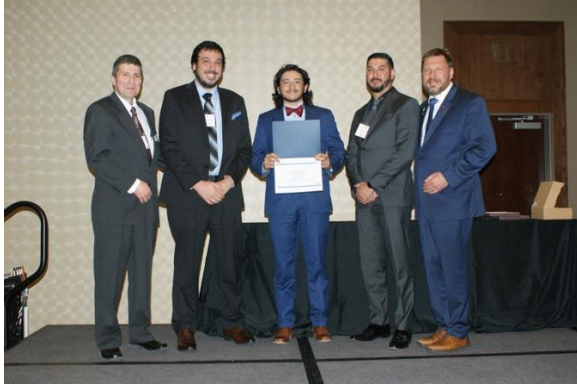
Second place, Round 2, was taken by the Robot Renegades from Texas A&M-Corpus Christi.