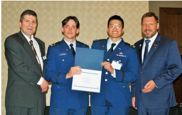
Second place went to the team from the US Air Force Academy.