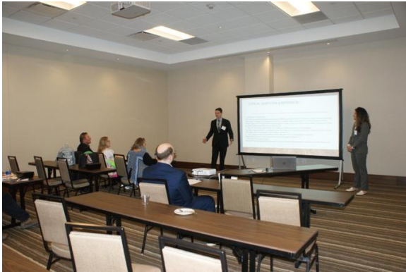
The competition is underway!