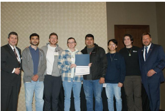
First place, Round 1, was awarded to the Panda Drone from The University of Texas – Arlington.