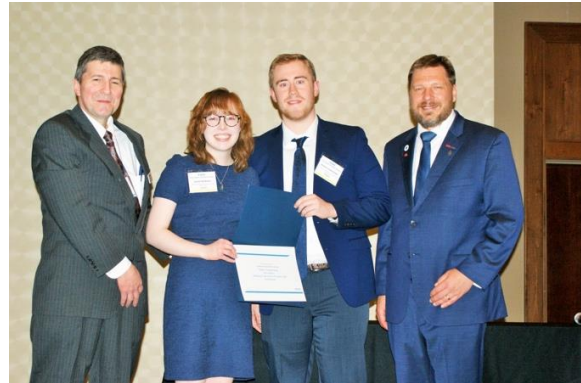
First place went to the Missouri Univ. of Science and Technology team.