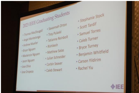
The roster of graduating seniors...

Graduating Seniors – The Graduation Class of 2023 was also recognized during the Awards Banquet with a token of recognition from Region 5.