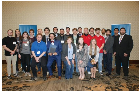
The Class of 2023...