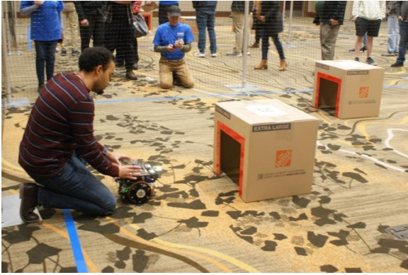
Ready to launch...