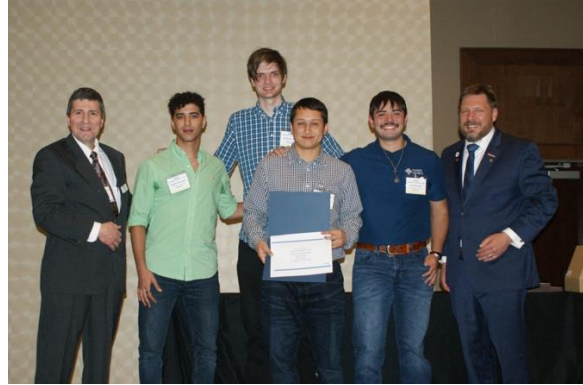
And first place, Round 2, went to the Null Nibble from St. Mary's University.

Graduating Seniors – The Graduation Class of 2023 was also recognized during the Awards Banquet with a token of recognition from Region 5.