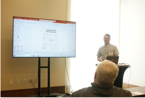
The competition is on...