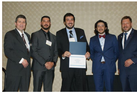
Second place, Round 1, was taken by the Robot Renegades from Texas A&M-Corpus Christi.