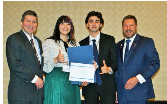
Second place went to the Texas A&M-Corpus Christi team.