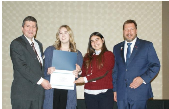
Third place was awarded to the Texas A&M-Corpus Christi team.