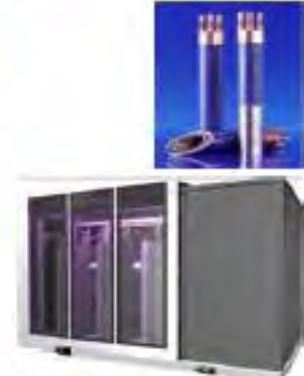
12kV, 800A Superconducting Fault Current Limiter