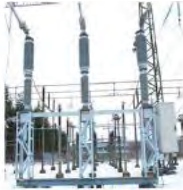
145kV 31.5kA 3150A CO 2 GCB