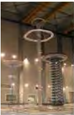
1200kV AC MOSA