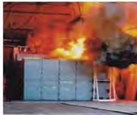
Internal arc failure