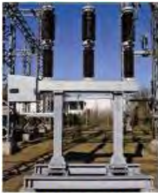
72.5kV 31.5kA 2500A VCB