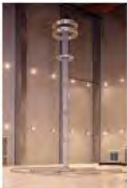
800kV DC MOSA