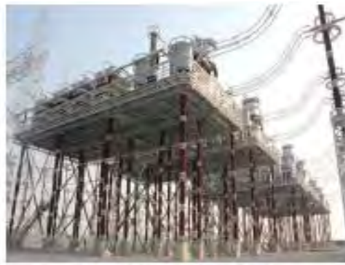
1100kV Series-capacitor bank