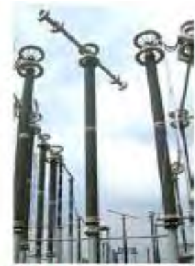
800kV DC Bypass Disconnecter