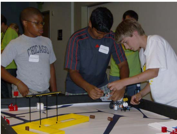
FIRST LEGO League campers fine tune their robot before putting it to the test.

Twenty-four middle school-aged students attended the FIRST LEGO League (FLL) Summer Camp from July 7-11. This new camp introduced these students to FLL, an international robotics program that promotes the excitement of discovery,