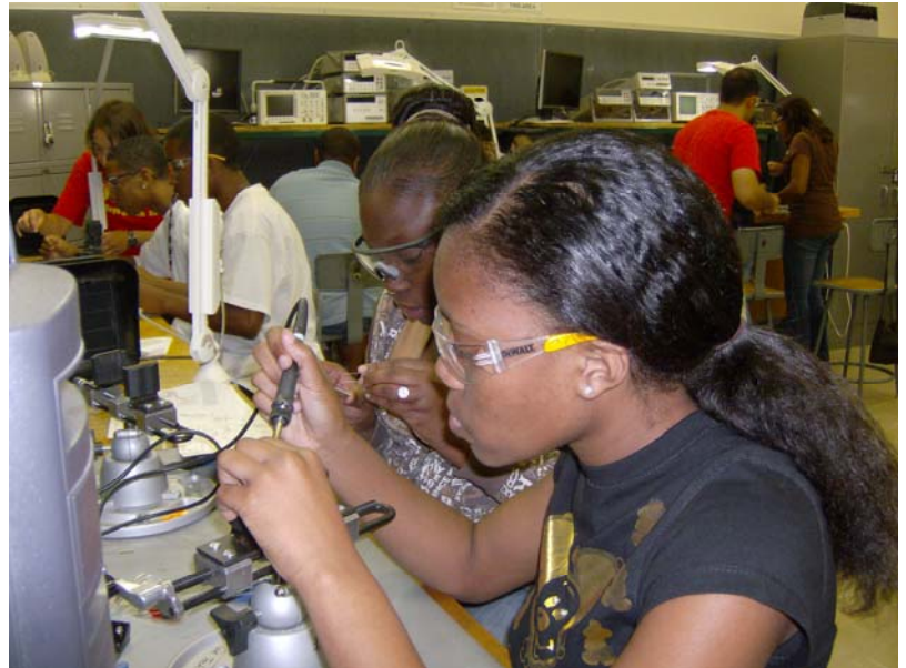
Students learn how to solder during HOT Days 2008.

With ECE faculty and students on hand to supervise, the camp attendees built computers, worked with robots, constructed a low pass filter, built simple digital logic circuits, constructed a speaker from common household parts, worked on electronics projects, and toured the GT Solar House. At the midpoint of each camp session, students went on a scavenger hunt that helped them to learn more about the Tech campus and its history and traditions. At the end of the week, students attended an admissions session and celebrated the end of the camp with a reception, where they received certificates of participation.