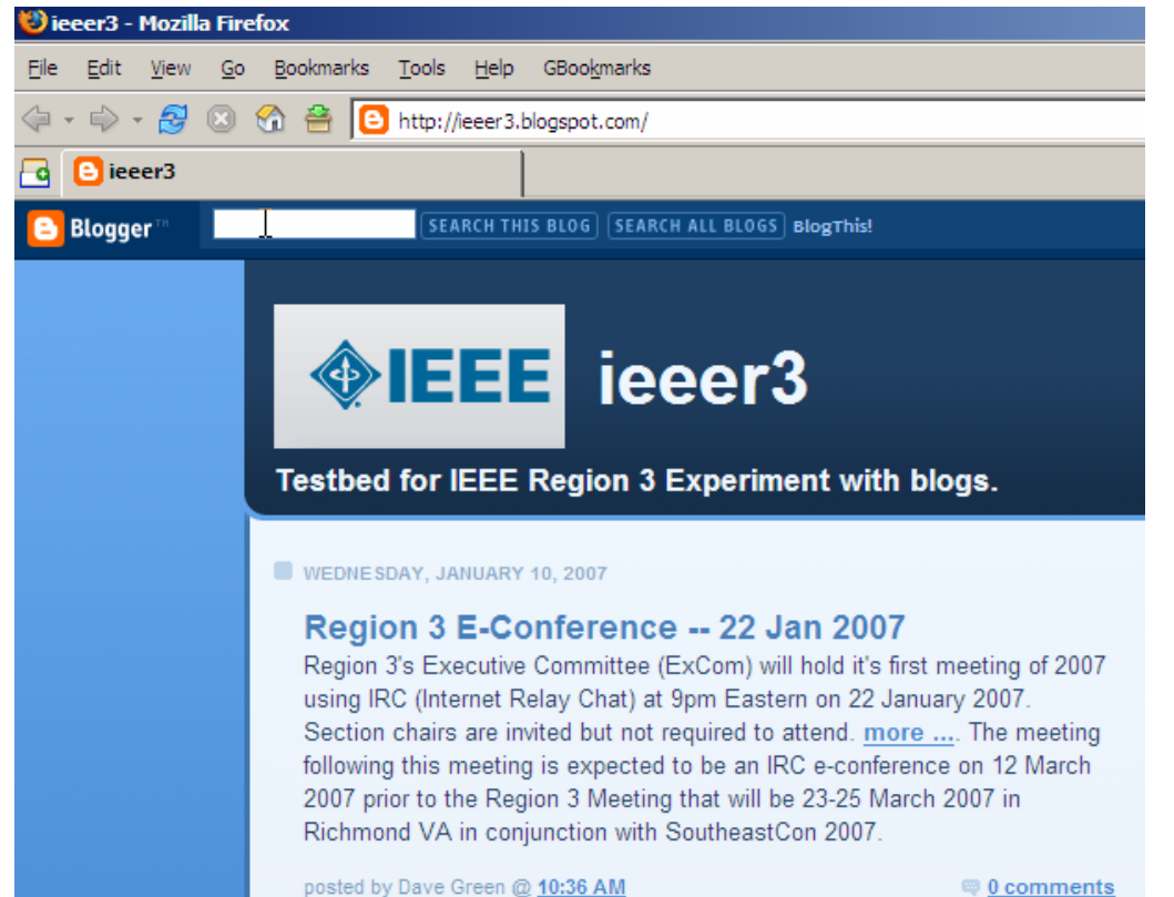
Screenshot of the Region 3 Blog providing timely information for IEEE volunteers

The whole world has heard about blogs, one of the key elements of Web 2.0. Blogs are one of the technologies that lead Time Magazine to select You as the person of the year. Now Region 3 volunteers have a blog to call their own.