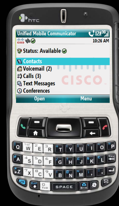
Cisco Unified Mobile Communicator