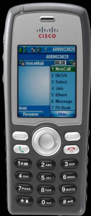
Cisco Unified Wireless IP Phones