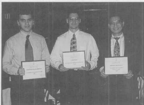
Outstanding Undergraduate and Graduate Student Award Recipients