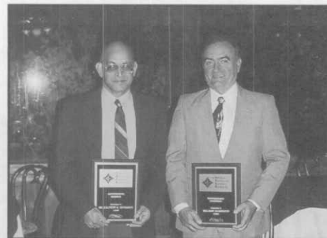
Outstanding Orlando Section Award Recipients