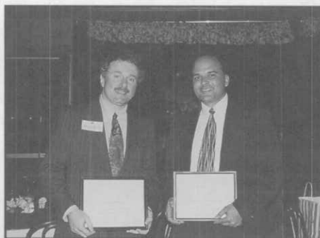
Chapter-of-the-Year Award Recipients