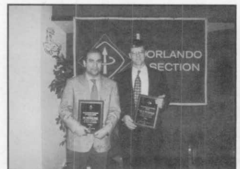
Florida Council IEEE Award Recipients