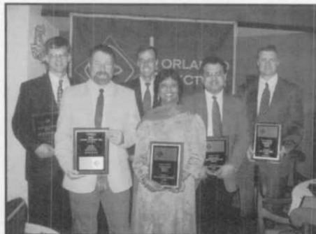
Outstanding Orlando Section Award Recipients