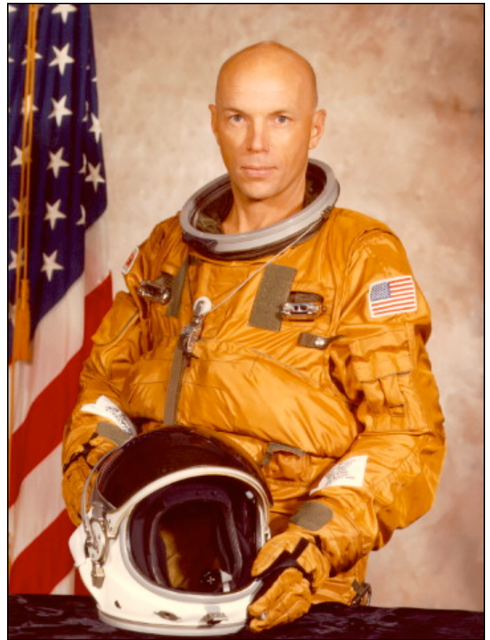
Story Musgrave's official NASA portrait.