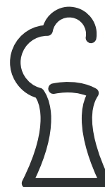
Nuclear Power Plant

GUTOR is a world-leading, top-ranked UPS (uninterruptible Power Supply) engineering company with headquarters in Wettingen (Switzerland). Since 2066, GUTOR has been part of Schneider Electric SA. Together with our worldwide partners, we offer a global business and service network.