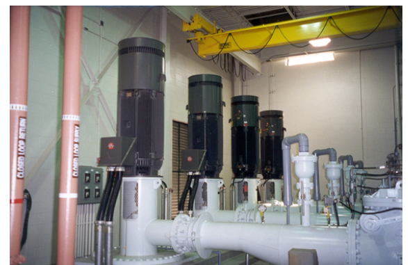
High Pressure Pumps