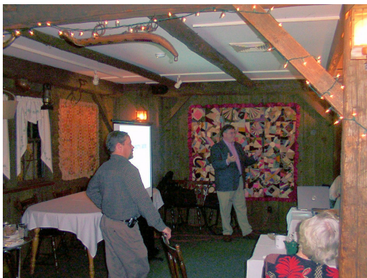
Speakers at the IEEE Berkshire Consultants Network meeting.