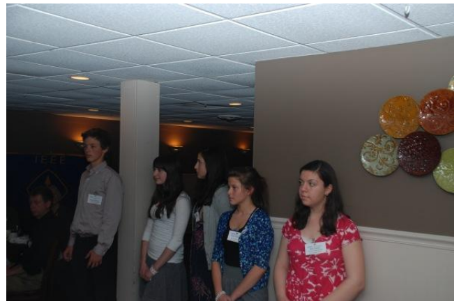
2011 Science Writing Contest Winners IEEE Berkshire Section