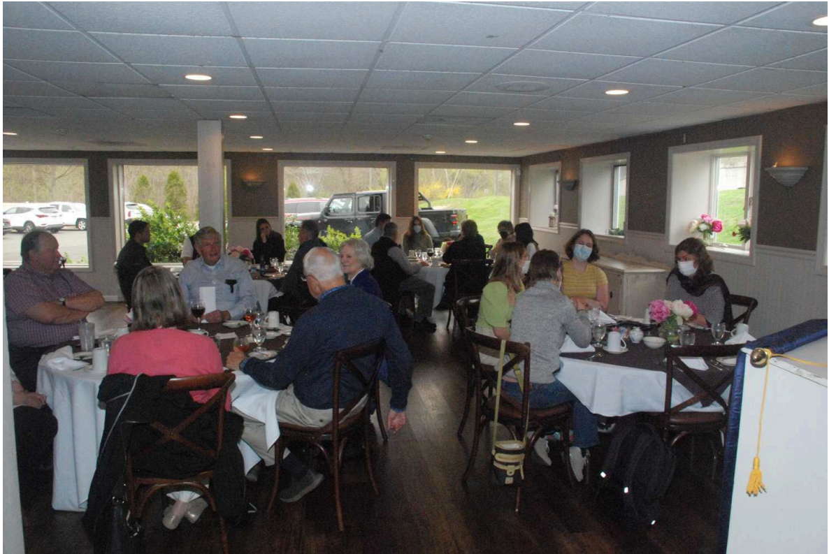
Berkshire Section members, students and their guest.