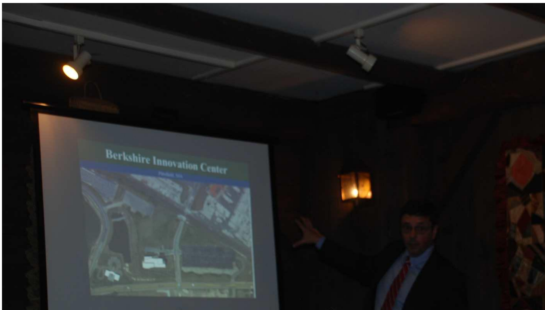
Facility plan for BIC at the William Stanley Business Park in Pittsfield, MA.