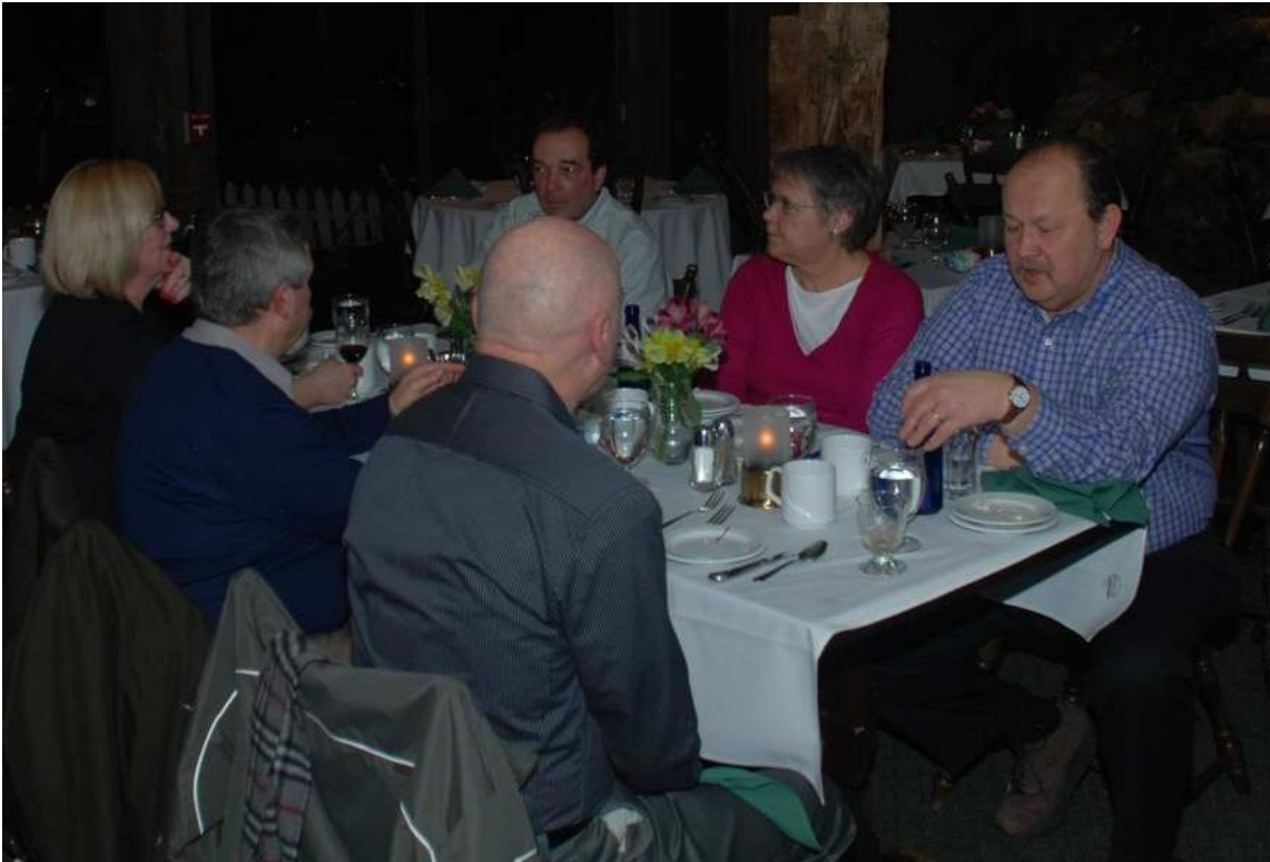
The Berkshire Section Members (cont.)