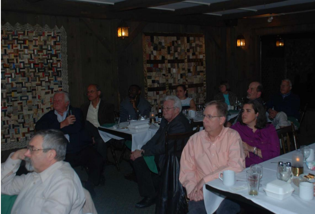
Audience: The Berkshire Section Members