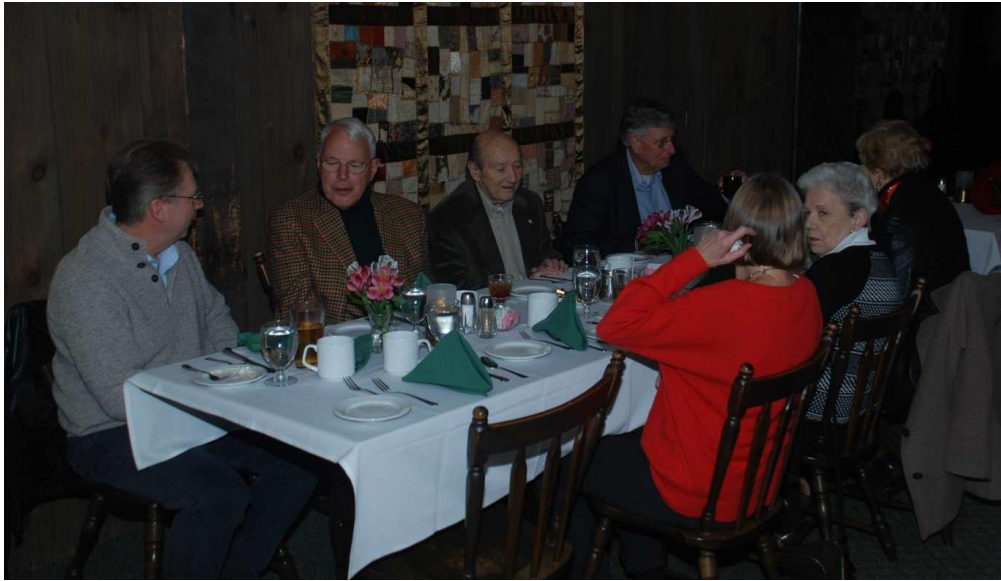
The Berkshire Section Members