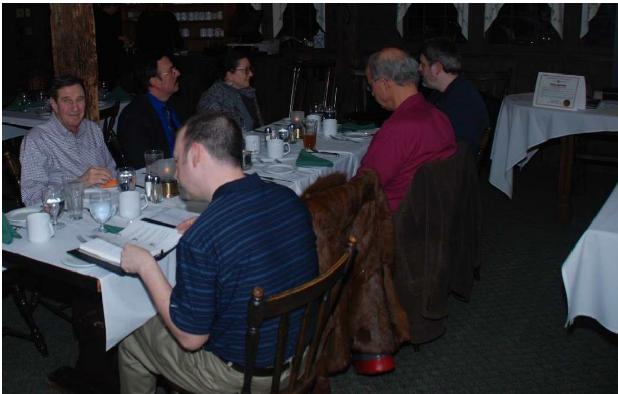
Berkshire Section Members at the Speaker table