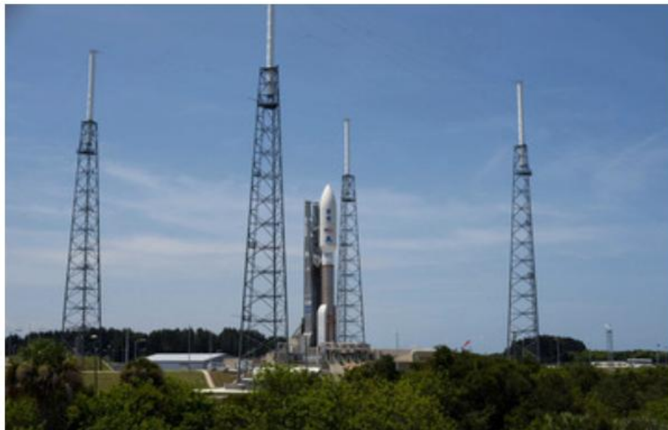
Well-designed lightning protection systems at critical launch pad