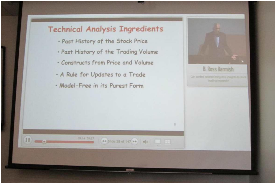
Proposed Technical Analysis