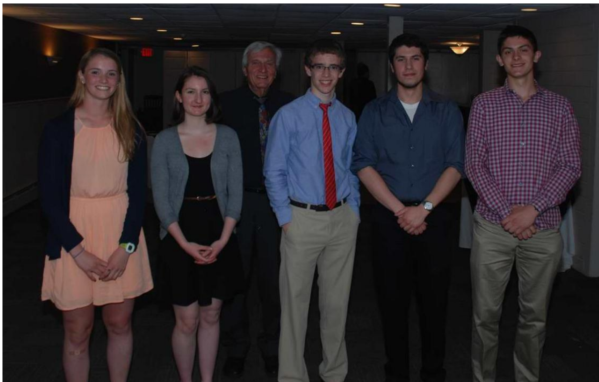
2015 IEEE Berkshire Section STEM Research Challenge Winners