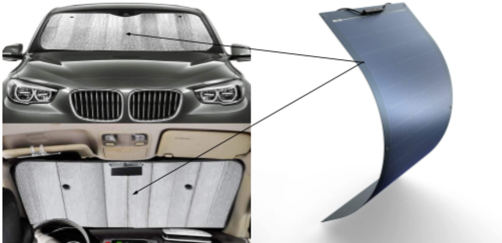
Figure 2 - Flexible Solar Panel and Sunshield [3]

To ensure cooling is maximized, temperature sensors will be placed within the vent shade of each window to compare the relative temperature difference between the sides of the car. This is done so that the coolest air is brought in from outside and the hottest air is exhausted while providing a consistent stream of airflow through the vehicle, thus removing or displacing the greatest amount of heat.