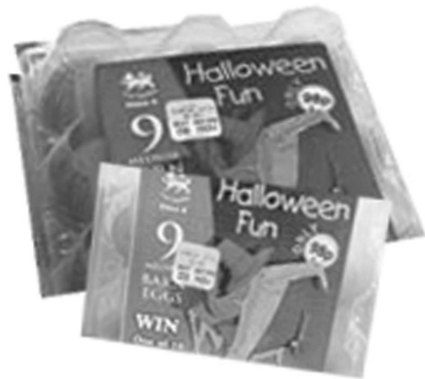
Figure 2 A commercial brand of eggs.

As is evident from the table, although these cases are spread across the period, there is a cluster in October, which is coincident with the Halloween season. This sort of mischief can be interpreted as innocent, but as seen in our series, can lead to severe ocular morbidity. For years now, resources have been placed on public education surrounding the dangers of fireworks, but no mention has been made of the dangers of egg throwing either around Halloween or at other times. Obviously, you cannot educate people against throwing objects at each other; you rely on their common sense. However, the recent advertising stunt by a leading supermarket in re-branding their eggs as mischief eggs (fig 2) must at least be considered to be irresponsible and at worst almost incitement to this type of assault. The medical community should expect those with most access to the nation's conscience—advertisers, retailers and TV programme makers—to act in a responsible manner against these and other easily preventable injuries.