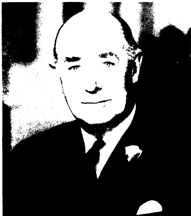
The Rt. Hon. Lord Porritt of Wanganui and Hampstead, GCVO, GCMG, CBE, FRCP.

At the Annual General Meeting on 9th May, 1987 the Right Honourable Lord Porritt was elected as Patron of the British Association of Sports Medicine. We thank Lord Porritt for his continuing interest in the affairs of the Association. For the benefit of more recent members of the Association, we reprint below some biographical information originally published in 14: 2 & 3 on the occasion of Lord Porritt's retirement from the presidency of BASM.