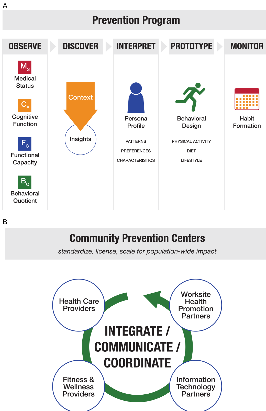
Figure 2 (A) Community Prevention Centers (CPCs) are actual facilities where scientific evidence-based medicine and human-centred design (HCD) are combined to develop and implement prevention programmes. While much of the interdisciplinary interaction remains to be precisely defined, the road map shown integrates the HCD approach with the traditional method of programme development. Initially, the medical status (MS) of each client is assessed as well cognitive function (CF), physical capacity (PC), and behavioural quotient (BQ). This input assists the healthcare professional in observing and understanding the context of the individual's current situation and generates insights regarding possibilities for behavioural change. Interpreting and synthesising these insights and contexts enables the development of archetypal personas that can be used to classify client services based on key characteristics that relate to the likelihood of success for certain interventions. Based on the experience and history with certain persona profiles, the healthcare professional can engage the client in an ideation process to target healthier behaviour. Single, achievable tasks that result in behavioural change are used as prototypes for iterations that build confidence and control. The evolving loop of habit formation