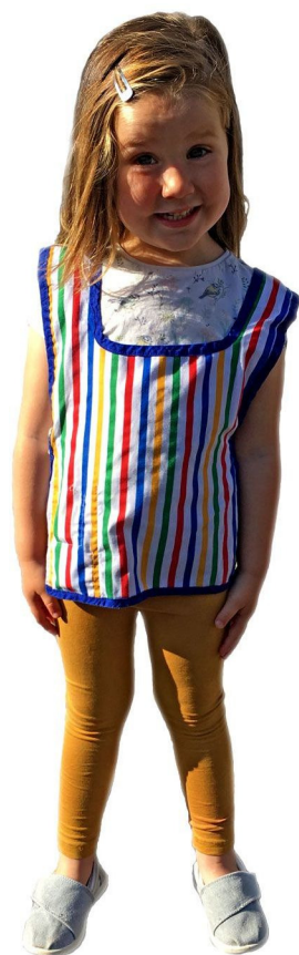
Figure 1 Custom-made tabard with inside pockets securing the two Fitbit Zips in position (contact first author for more details on tabard construction). Consent was obtained for the publication of the child's photograph.

children typically landed on one foot first and then the other to regain their balance. If a child slid their feet along the ground or the movement was so small that the coders could not identify a step-like movement, a 'no-step' was recorded.