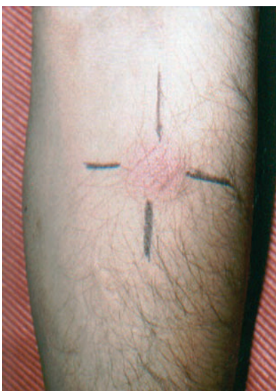
Figure 2 Forearm showing positive Mantoux reaction.

On physical examination, the penis shape was like a saxophone. The prepuce and glans penis were oedematous and indurated. The glans penis had multiple sinuses around the urethral meatus (fig 1). On squeezing the penis, pus was expressed from the meatus and the sinuses. The glans penis also showed areas of depigmentation (vitiligo). The distal part of the shaft of the penis showed induration involving corpora cavernosa whereas the proximal part was devoid of any lesion. The testes, bilateral epididymis, and scrotum were normal. The vas deferens was normal on