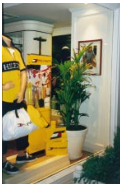
The Istanbul branch of Tommy Hilfiger prominently displayed Marlboro F1 clothing and pictures (left), until replaced (right) after the Turkish committee on smoking and health threatened legal action.