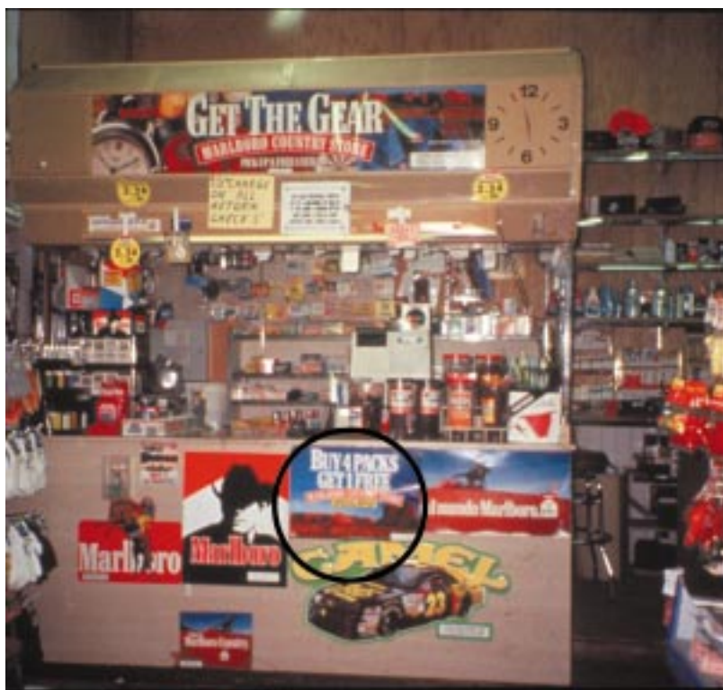
A typical point-of-sale display featuring special promotions (circled) and tobacco advertising.