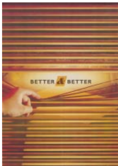
Benson & Hedges' indirect marketing campaign exploits recognition of the familiar ampersand.

stages, until only the ampersand remains; a similar development is expected in television ads. Meanwhile the Malaysian public has been slowly trained to associate the ampersand with the cigarette brand name. It seems obvious that one goal of this exercise is to prepare the public for the day when cigarette brand names will be banned in any promotions, in the hope that the ban is sufficiently badly drafted to let the "&" get through.