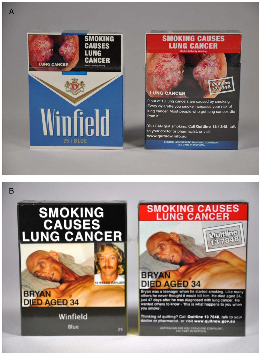
Figure 1 (A) Typical Australian tobacco packs, back and front before... (B)...and after the introduction of tobacco plain packaging. Source: Quit Victoria collection, 2012.