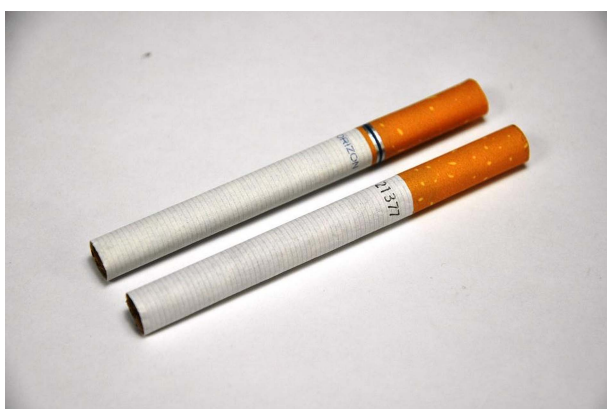
Figure 2 Horizon cigarette sticks before and after introduction of legislation.