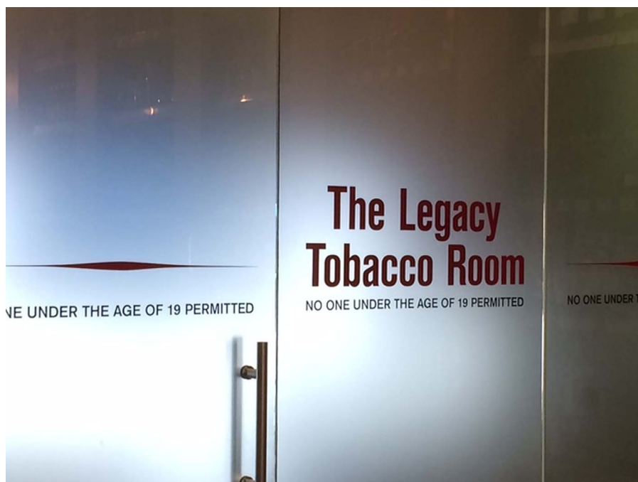
Figure 2 The door to the 'Legacy Tobacco Room' at the liquor store of the same name in British Columbia, Canada.

Morris, RJ Reynolds, Brown & Williamson and Lorillard—to a coalition of attorneys general of 46 states and five US territories as compensation for tobacco-related Medicaid costs.