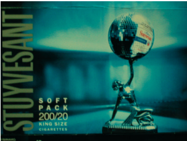
Figure 3 Detail of art on Peter Stuyvesant carton.

these festival appearances was linked to similarly retro-chic club nights, also under the DWA brand, promoted as a follow up to the festival. Invitations included a fictional back story