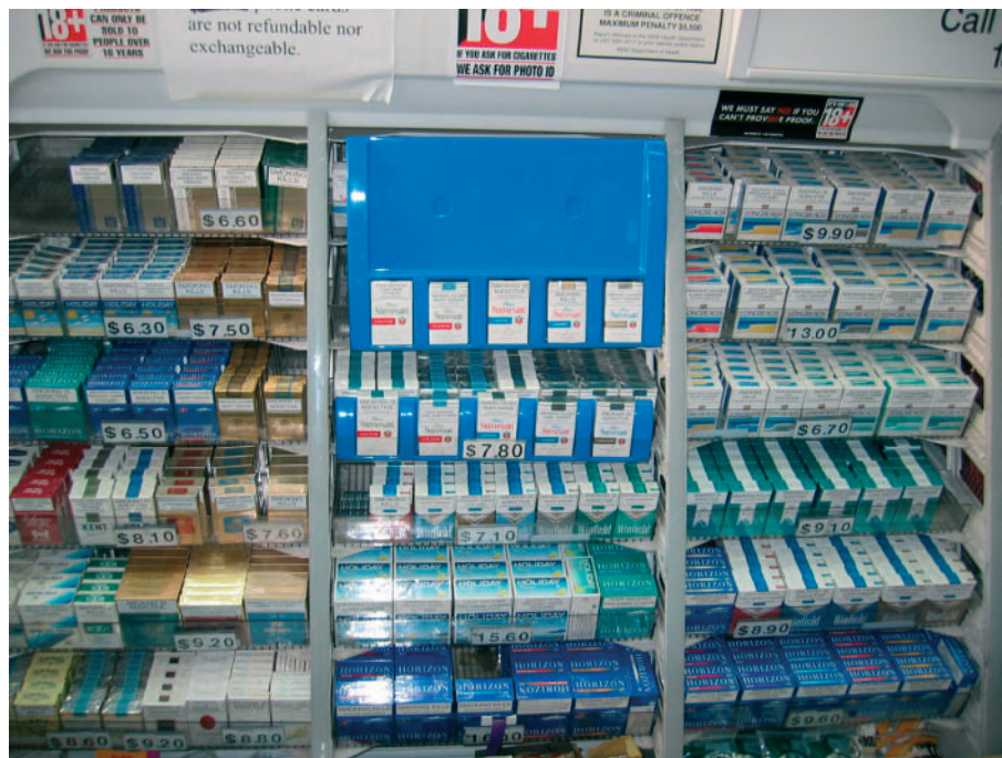
Figure 1 Custom-made blue plastic display to highlight the Peter Stuyvesant range within the existing display cabinet.