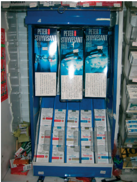
Figure 2 Stand-alone blue plastic Peter Stuyvesant display unit using carton sides to provide advertising imagery.