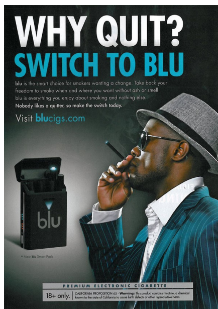
Figure 4 The copy of this Blu advertisement states, “Nobody likes a quitter, so make the switch today” and boldly questions “Why Quit?”

policies. 23 E-cigarette promotions often show indoor settings to imply that vaping is still possible when cigarette smoking is not. Dual use is not harm reducing in such instances as consumers remain cigarette smokers, yet they are likely to vape when they might otherwise be inhibited from smoking (figure 3). There is indication that continued smoking, even if reduced, is unlikely to result in notable health benefits. 24 Several studies have also found that dual users, who are trying to quit or reduce smoking, are less successful in their cessation attempts. 25–27 Given the profit maximisation aims of the tobacco industry, it is not in their strategic interests to have consumers successfully quit and exit the market altogether (figure 4).