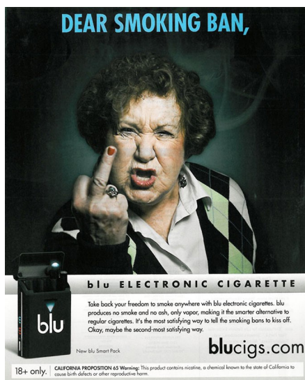
Figure 2 The e-cigarette brand, Blu, is produced by Imperial Brands in the UK, which acquired the brand from the Lorillard Tobacco Company in the USA. This advertisement for Blu depicts a woman defiantly giving the finger at the thought of an indoor smoking ban. The copy of this advertisement states, ‘take back your freedom to smoke anywhere with blu electronic cigarettes’.