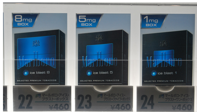
Figure 5 Marlboro Ice Blast variants available from a vending machine in Japan with reported tar yields of 8 mg, 5 mg and 1 mg and the cigarette packaging depicts numbers and sequentially different rooftop sizes to communicate comparative tar yields. The price is listed as 460 Japanese Yen, which is equivalent to slightly more than US$4. The photo, dated 1 November 2016, was taken by Timothy Dewhirst.

they are not allowed to offer multiple variants of a brand family, given that cigarette brand families are typically based on a hierarchy of reported tar yields with variants subsequently inferring a hierarchy of reduced harm.