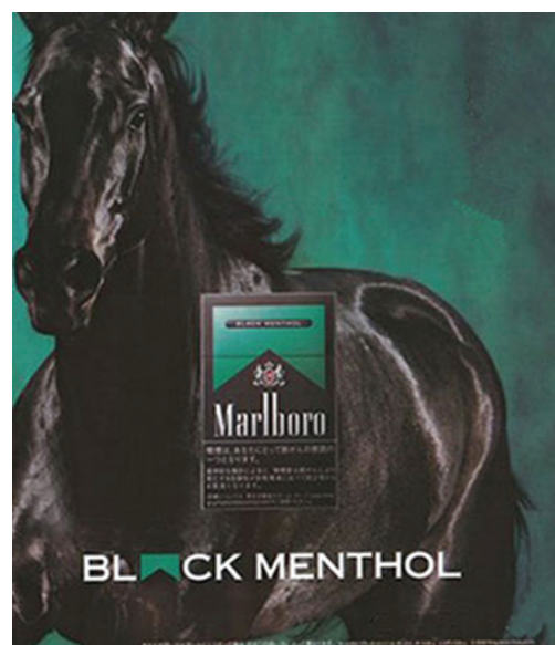
Figure 1 When Marlboro Black Menthol was launched in Japan, marketing communication for the brand depicted a strong black stallion in motion. The brand's marketing communication in Indonesia and the Philippines also featured a black stallion.

Intrafamily codes continue to be used to infer relative harm for PMI's new brand architecture that includes Marlboro brand variants being offered in black-coloured cigarette packages. A hierarchy of relative harm is communicated on the basis of