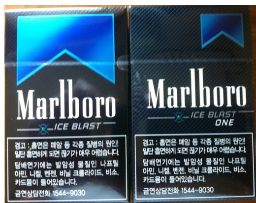
Figure 2 Cigarette packages for Marlboro Ice Blast variants in South Korea, where a larger blue-coloured rooftop is seen for the variant with a supposed tar yield of 6.0 mg and a comparatively smaller-sized rooftop is used for the variant reporting a tar yield of 1.0 mg. The size of the Marlboro rooftop serves as a code for communicating the relative machine-measured tar yield.

numbers and size of the Marlboro rooftop symbol. As seen in figure 2, Marlboro Ice Blast offerings both portray blue-coloured rooftops, but a larger rooftop is observed for the variant with a supposed tar yield of 6.0 mg, whereas a comparatively smaller-sized rooftop is used for the variant with a supposed tar yield of 1.0 mg. Moreover, to reinforce the importance of 1.0 mg being a low nominal tar yield, the smaller rooftop variant is identified as Marlboro Ice Blast One. When purchasing both variants of Marlboro Ice Blast at a convenience store in South Korea, the receipt pointed to the brand variants' comparative machine-measured tar yields alongside the price (figure 3). As seen in figure 4, advertising at the point of sale explicitly