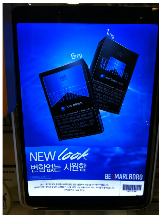
Figure 4 Point-of-sale advertising for Marlboro Ice Blast at a convenience store in South Korea, where ad copy refers to the brand's 'new look' (in English), which presumably refers to the cigarette packaging, while indicating that the coolness, as experienced from the flavour capsule, remains unchanged (in Korean). The photo, dated 18 July 2015, was taken by Timothy Dewhirst.

The offering of variants and line extensions prompt the perception that there is a hierarchy of 'strength', based on sequentially reported tar yields, and thereby an apparent offering of sequentially 'less harmful' options from the parent anchoring brand. Advertising and promotions that point to a cigarette brand's supposed low-tar delivery are regarded as misleading, however, as tar and nicotine yields generated for cigarettes smoked by machines are appreciably lower than the yields actually delivered to compensating smokers. 16-22 Policy interventions to counteract tobacco companies from communicating a hierarchy of supposed relative harm within brand families include implementation of: (1) standardised packaging with one standard package colour and no imagery and design elements allowable (as observed in Australia) and (2) a single presentation requirement, which means that tobacco companies can offer only one member of a brand family (as observed in Uruguay). Thus, PMI, for example, can offer Marlboro Red or Marlboro Gold, but not both in Uruguay (the company can only offer one 'Marlboro'). It remains the option of tobacco companies as to which brand variant they want to offer, but