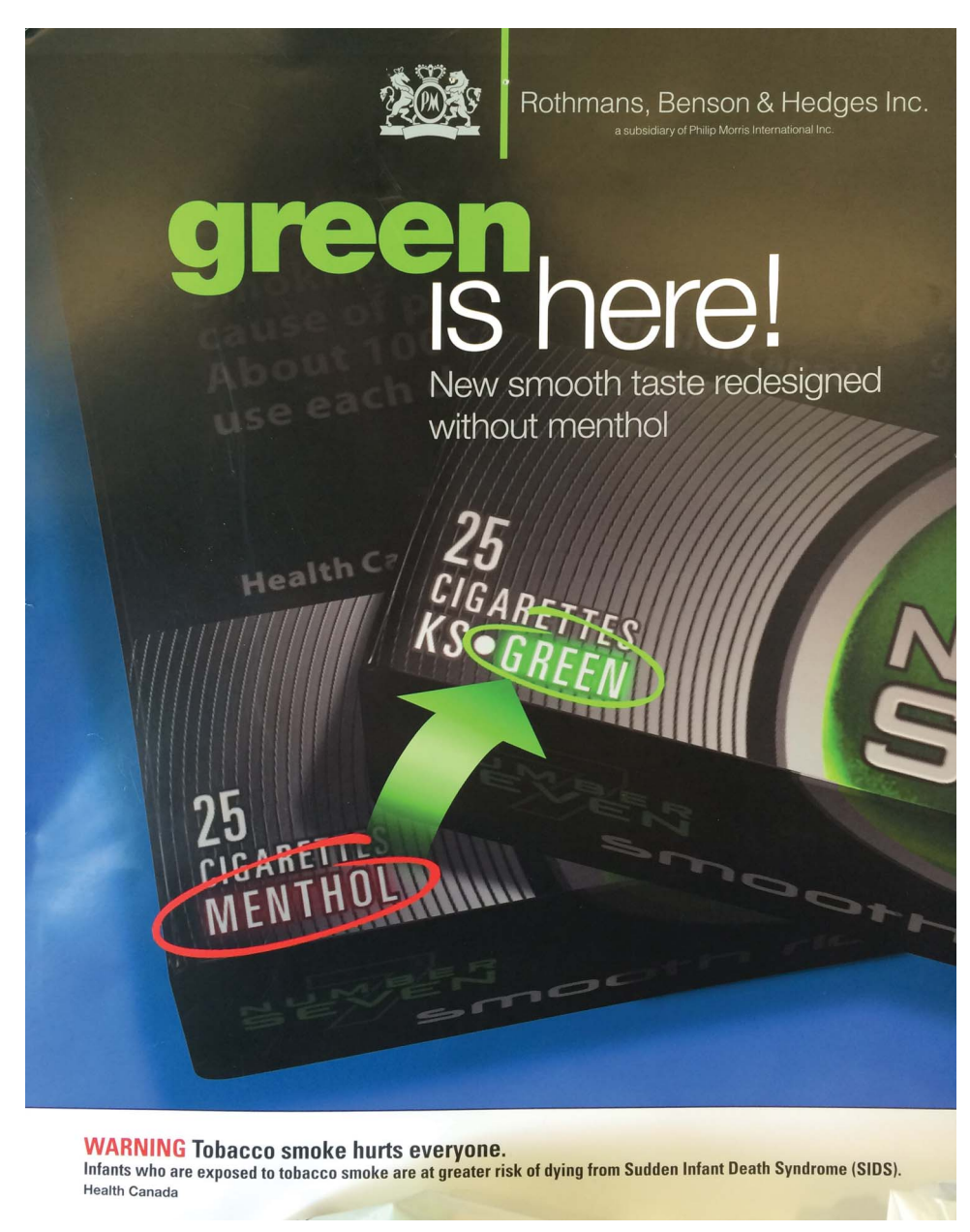
Figure 3 Business-to-business marketing materials from Rothmans, Benson & Hedges (owned by Philip Morris International), demonstrating the shift to menthol replacement packs.