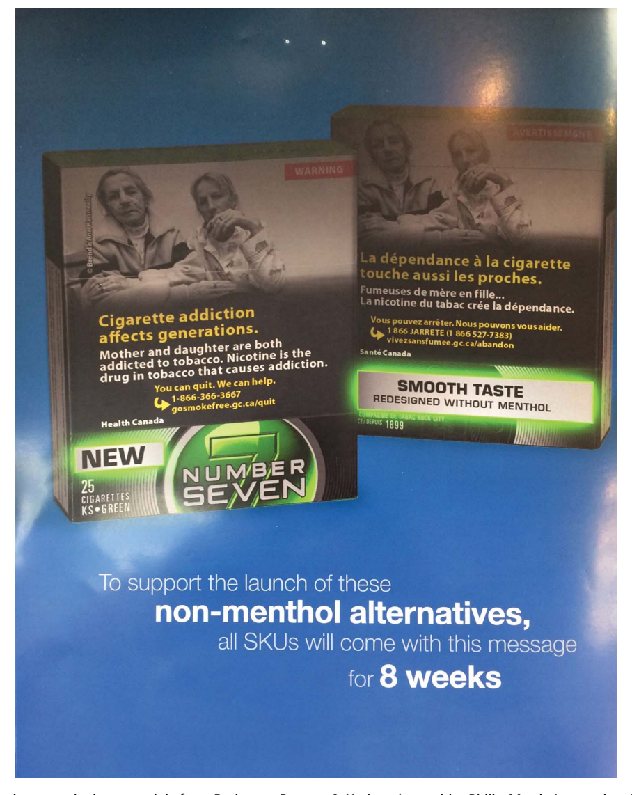
Figure 2 Business-to-business marketing materials from Rothman, Benson & Hedges (owned by Philip Morris International), highlighting the message on cellophane wrapping on new packs.