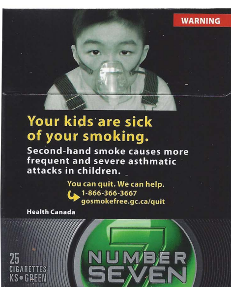
Figure 1 Left: Number Seven menthol pack preban with the 'menthol' descriptor at the bottom left; Right: Number Seven menthol replacement pack postban with the 'green' descriptor at the bottom left.