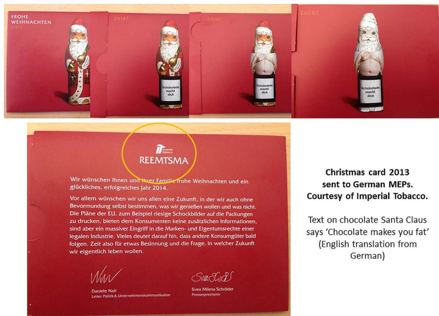
Christmas card 2013 sent to German MEPs.

Text on chocolate Santa Claus says ‘Chocolate makes you fat’ (English translation from German)