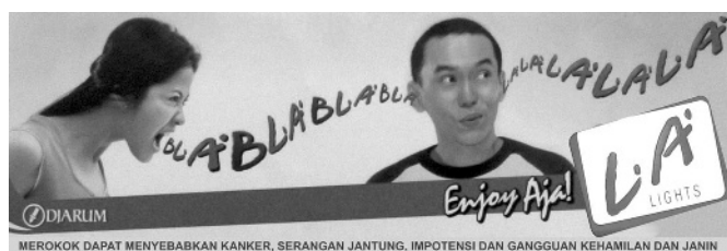
Figure 1 Billboard for LA Lights.

classy breed” that the cigarette holds as its promise. Adverts for other youth brands, such as LA Lights, commonly feature a lineup of cosmopolitan males and females dressed provocatively. In this context of youth sociality, women appear to be lending approval to smoking as a behaviour one engages in to have fun. In interviews and focus groups, informants noted that young women who smoke tend to prefer A Mild, LA Menthol Lights and Marlboro Lights. Of the three, the former two include women in their adverts. In 2008, two new slim cigarettes (Djarum Black Slims and Surya Slims) were introduced into the market. The billboards and banners that line the streets do not have a photo, but rather feature the slim sleek package. Although women are not visibly connected to these new product lines, slims are typically the domain of women.