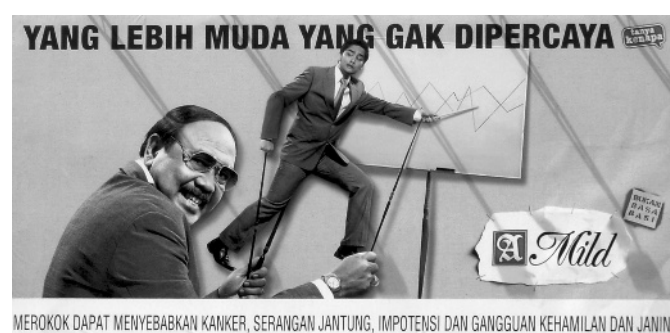
Figure 3 A Mild advert "The younger generation that is not trusted".

Project QTI researchers are currently in the process of developing and testing counter-advertising messages that popularise a non-smoking identity. Two coextensive cultural themes that are being developed for use include: (1) willpower as a virtue associated with masculinity and (2) family responsibility as a value that eclipses personal pleasure. Both of these themes tap into Javanese images of strength and moral identity. Challenging one's self to overcome hunger, thirst and even sleep is respected in Javanese culture. An association of strength with willpower and moderation is well articulated during Ramadan, a time when inner strength and control of one's desires is valorised. During the fasting month, one must abstain from eating all day and, when breaking one's fast, also exercise control to not indulge in the overconsumption of food.