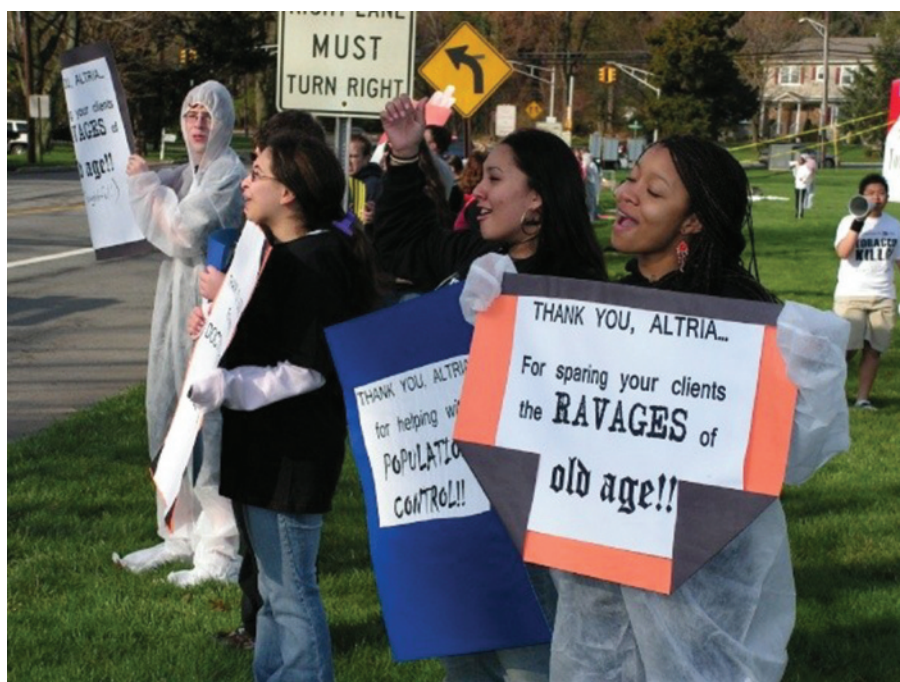
USA: international youth protest at Altria's AGM

The report cites a wide range of examples of promotions that are clearly