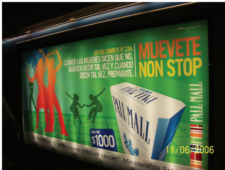
An ad for BAT's Pall Mall brand in Chile

aimed at young people in the most vulnerable societies of the world. In the words of a South African agency, "Lucky Strike South Africa embarked on a radical strategy to re-launch and grow the brand by targeting the underground youth community—a community that is left of centre, which sets the trends rather than following them." And Pete Doherty of Babyshambles , which a music magazine said recently was "as famous for canceling gigs as they are for Doherty's drug dependence," is often photographed with his Lucky Strike pack. As a British marketing expert put it, "If you really want to create a buzz for your brand in the youth counter-culture, find yourself a bad boy pop star, give him your product and line up your favourite paparazzo." Doherty features on the back of the ASH report.