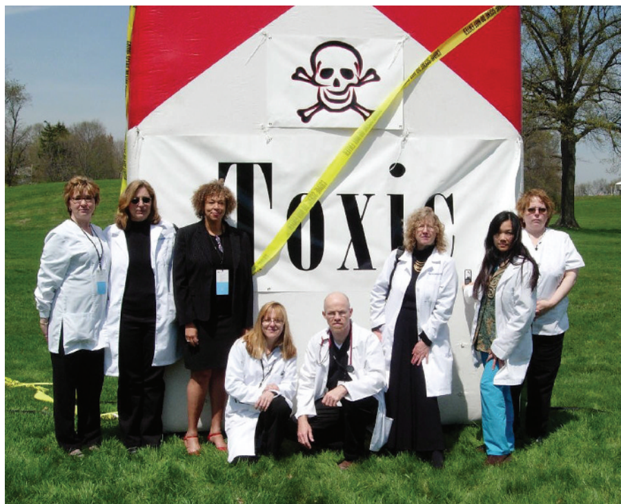
USA: Nightingales nurses protest at Altria's AGM