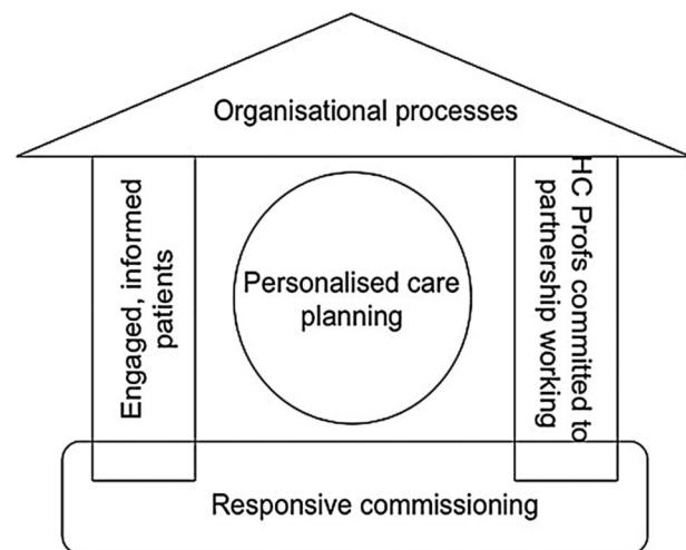
Figure 1 House of Care. Reproduced with permission of The King's Fund. Source: Coulter A, Roberts S, Dixon A (2013). Delivering better services for people with long-term conditions: building the house of care. London: The King's Fund. Available at: http://www.kingsfund.org.uk/publications/delivering-better-services-people-long-term-conditions

The concentric circles around the interactions between patients and professionals suggest that these