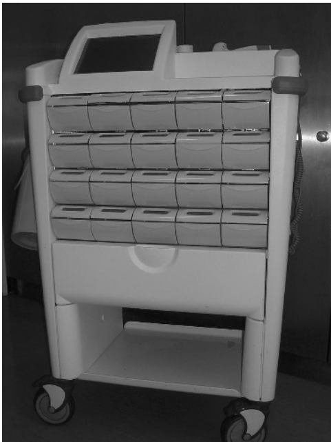
Figure A3 One of the two electronic drug trolleys. One drawer is allocated to each patient for whom medication is due and their name shown on the liquid crystal display. The barcode scanner is on the top of the trolley.