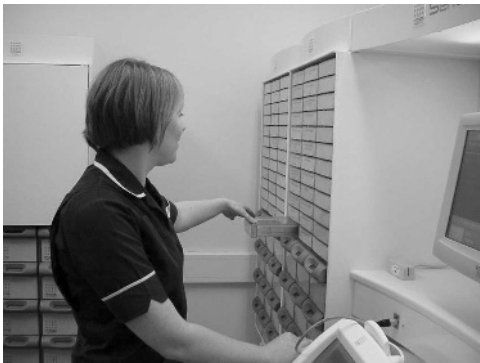
Figure A2 Nurse selecting stock medication from drawer in automated cabinet. The patient-specific drawers can be seen below the open drawer, and the screen to the right. Photo published with nurse’s permission.

Medication prescribed “to be given when required” was generally given separately outside the main drug rounds.