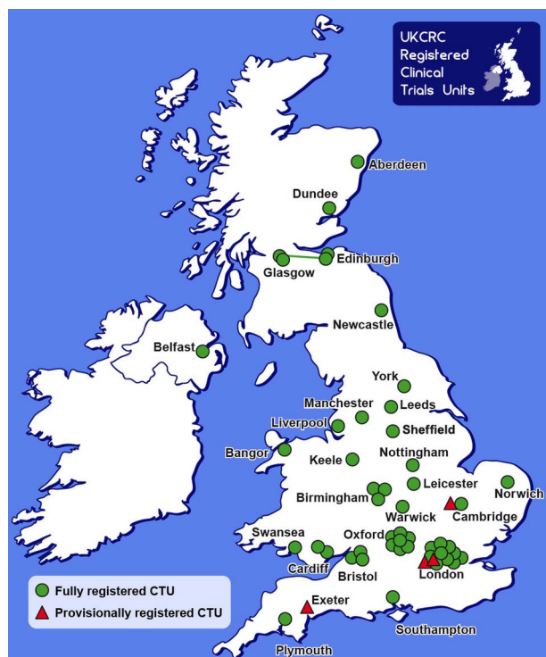
Figure 1 Map of the UK Clinical Research Collaboration (UKCRC), registered clinical trials units (CTUs).