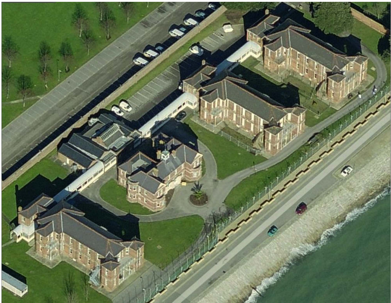
Figure 2 The 'new' Haslar Zymotic Hospital built from 1899 to 1902. It is now due for demolition.

(1707–1782), who made similar observations regarding infectious diseases in British Army camps and is often considered to be the father of military medicine. 10