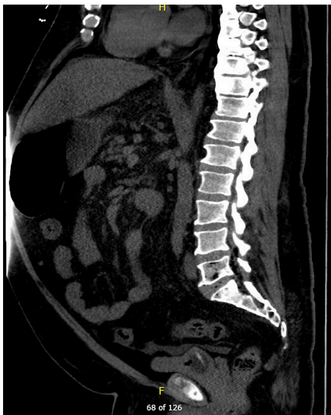
Figure 5 Interval CT abdomen and pelvis (sagittal section) showing air within the L5 vertebral body, S1 vertebral body and L5-S1 disc space suggestive of emphysematous osteomyelitis.