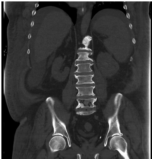
Figure 4 Interval CT abdomen and pelvis (coronal section) showing air within the L5 vertebral body, S1 vertebral body and L5-S1 disc space suggestive of emphysematous osteomyelitis.