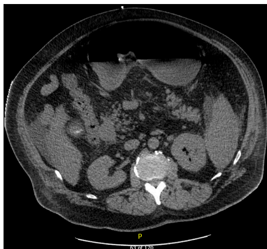
Figure 1 CT scan of the abdomen (axial section) showing left emphysematous pyelonephritis.

was suggestive of emphysematous osteomyelitis (EO) (figures 4 and 5). The patient developed acute kidney injury, so antibiotics were switched to intravenous meropenem and linezolid. Blood cultures grew Escherichia coli ( E. coli ), linezolid (5 days) was then discontinued and meropenem (7 days) was then switched to ceftriaxone. Soon, he developed hives, it was attributed to ceftriaxone and was shifted to aztreonam which was renally dosed. Transoesophageal echo was performed since he had prolonged E. coli bacteraemia and was negative for vegetations. The blood cultures also cleared up, and he showed clinical improvement. He was subsequently discharged on aztreonam. A follow-up MRI of the back was recommended in 8 weeks.