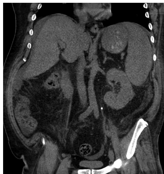
Figure 2 CT scan of the abdomen (coronal section) showing left emphysematous pyelonephritis.

was suggestive of emphysematous osteomyelitis (EO) (figures 4 and 5). The patient developed acute kidney injury, so antibiotics were switched to intravenous meropenem and linezolid. Blood cultures grew Escherichia coli ( E. coli ), linezolid (5 days) was then discontinued and meropenem (7 days) was then switched to ceftriaxone. Soon, he developed hives, it was attributed to ceftriaxone and was shifted to aztreonam which was renally dosed. Transoesophageal echo was performed since he had prolonged E. coli bacteraemia and was negative for vegetations. The blood cultures also cleared up, and he showed clinical improvement. He was subsequently discharged on aztreonam. A follow-up MRI of the back was recommended in 8 weeks.