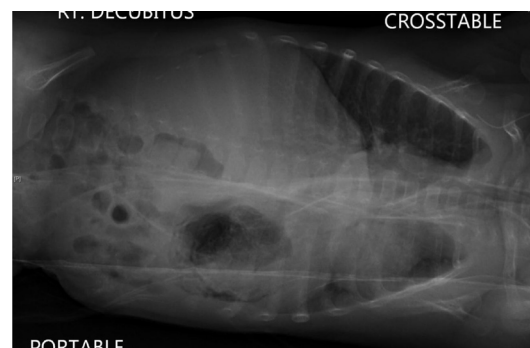
Figure 2 Lateral decubitus abdomen X-ray demonstrating the gastric pneumatosis. No evidence of free air excluding gastric or associated bowel perforation.

After 3 weeks, enteral feeding was commenced. Once more, she developed abdominal distension. Upper gastrointestinal contrast study revealed intestinal obstruction. Severe stenosis at the most distal jejunal anastomosis was identified. Resection and anastomosis were performed. Another 2 days