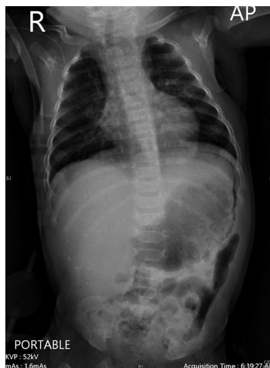
Figure 1 Chest and abdomen X-ray showing a rim of intramural gas in the wall of the stomach, that is, consistent with gastric pneumatosis. No radiological features of necrotising enterocolitis could be seen in the intestine.

At the age of 50 days, she developed several episodes of vomiting associated with abdominal distension. Abdominal radiograph (figures 1 and 2) showed isolated gastric pneumatosis (GP). Abdominal ultrasound scan did not show any evidence of pyloric stenosis. Her C reactive protein was slightly raised at 14.2mg/L. The platelets count was normal, and her blood culture result showed no growth. She had to receive HHHFNC at 4L/min for 24 hours as part of the supportive care management. Enteral feeds were suspended for 5 days. A course of broad spectrum triple intravenous antibiotic therapy was administered for the same