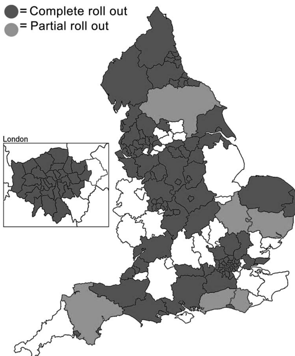
Figure 3 Extent of roll out of Bowel Cancer Screening Programme by primary care trusts in October 2008.

than women (1.5%) ( \chi^2=1445 , p<0.00001 ). This difference was of similar magnitude across all areas.