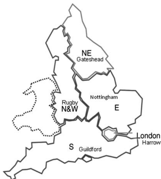
Figure 1 Areas of England covered by five regional Bowel Cancer Screening Programme hubs.

Patients are given the results of colonoscopy by the SSP before they leave the department. Where nothing abnormal has been found, the patient is discharged from that round of screening and informed that they will be invited again for screening in 2 years' time (provided that they are still within the eligible age range). Where one or more polyps have been removed, the patient is offered an appointment at an SSP follow-up clinic in the next week. Adenoma surveillance is based on the current British Society of Gastroenterology (BSG) guidelines. 13 If patients with adenomas are categorised as intermediate or high risk, they enter the screening surveillance programme. This surveillance programme is part of the BCSP and surveillance colonoscopies are scheduled and performed by the screening centre. Such patients are sent no further invitations to take part in further FOB testing rounds until they leave surveillance. If patients with adenomas are categorised as low risk, they do not enter the screening surveillance programme, but are discharged from that round of screening and informed that they will be invited again for screening in 2 years' time (provided that they are still within the eligible age range). If a cancer is found, the patient's care is taken over by the hospital's multidisciplinary team for the management of colorectal cancer.