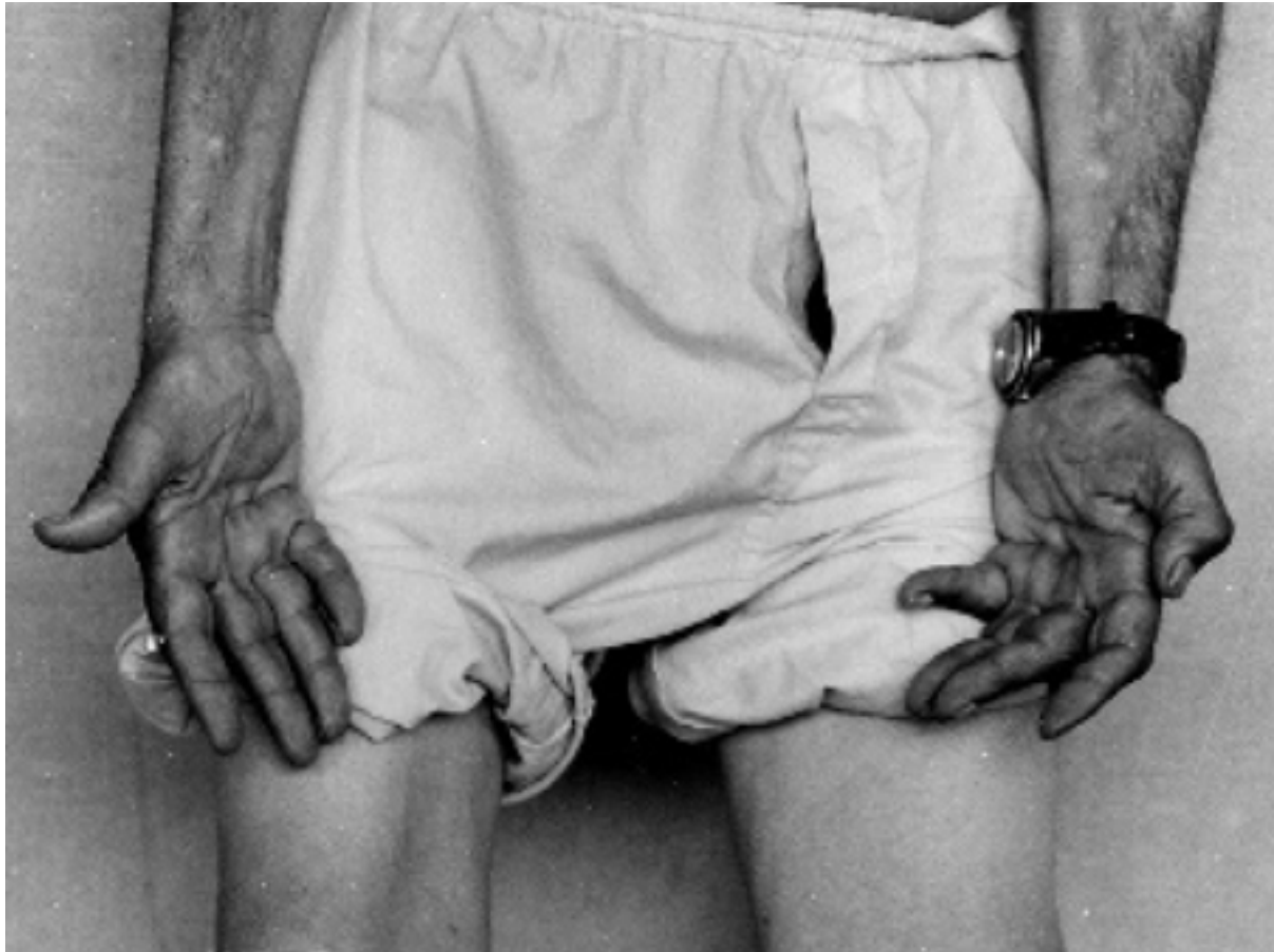
Figure 3: Wasting of hand muscles in patient with CMT1A

Adapted from Berciano J, Gallardo E, Garcia A, et al. Charcot-Marie-Tooth disease type 1A duplication with severe paresis of the proximal lower limb muscles: a long-term follow-up study. J Neurol Neurosurg Psychiatry. 2006 Oct;77(10):1169-76