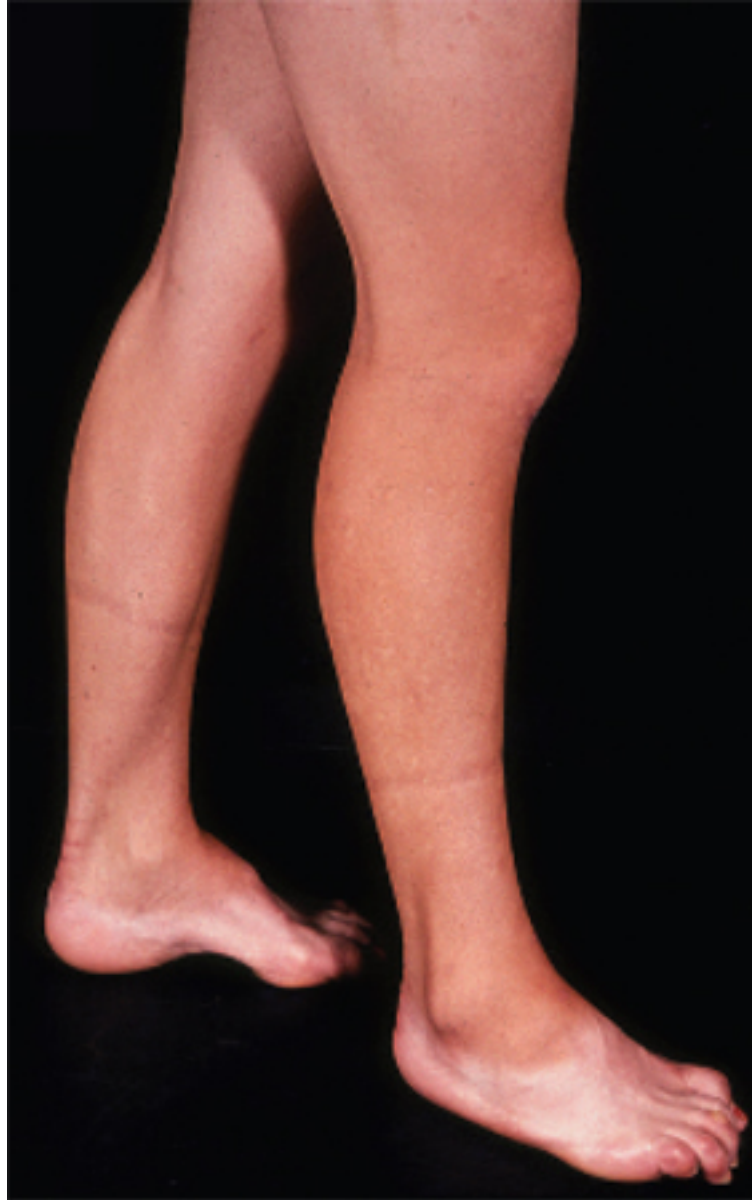
Pes cavus, toe clawing, and bilateral peroneal muscular atrophy in patient with CMT1A Adapted from Berciano J, Gallardo E, Garcia A, et al. Charcot-Marie-Tooth disease type 1A duplication with severe paresis of the proximal lower limb muscles: a long-term follow-up study. J Neurol Neurosurg Psychiatry . 2006 Oct;77(10):1169-76