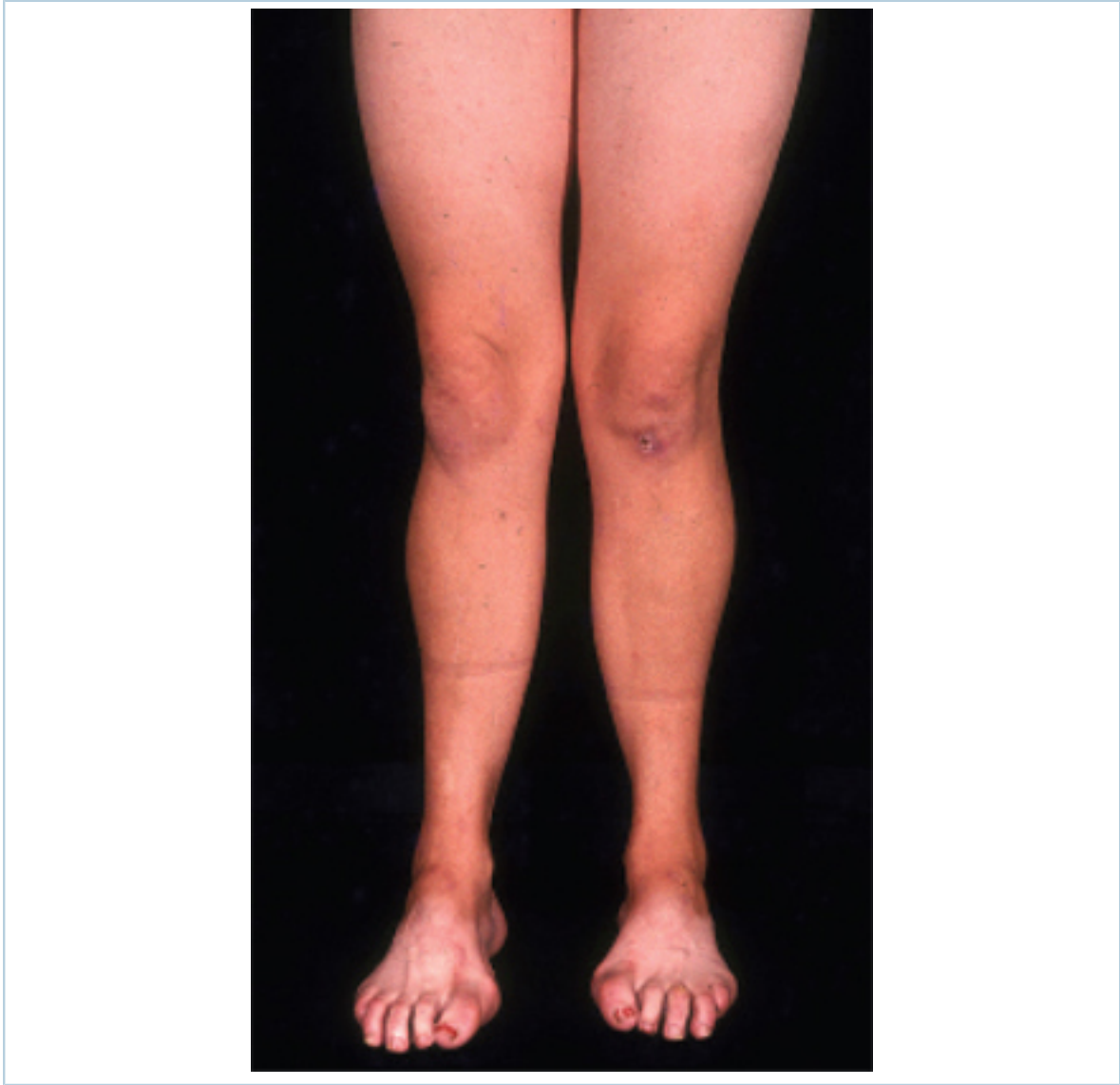
Pes cavus, toe clawing, and bilateral peroneal muscular atrophy in patient with CMT1A

Adapted from Berciano J, Gallardo E, Garcia A, et al. Charcot-Marie-Tooth disease type 1A duplication with severe paresis of the proximal lower limb muscles: a long-term follow-up study. J Neurol Neurosurg Psychiatry. 2006 Oct;77(10):1169-76