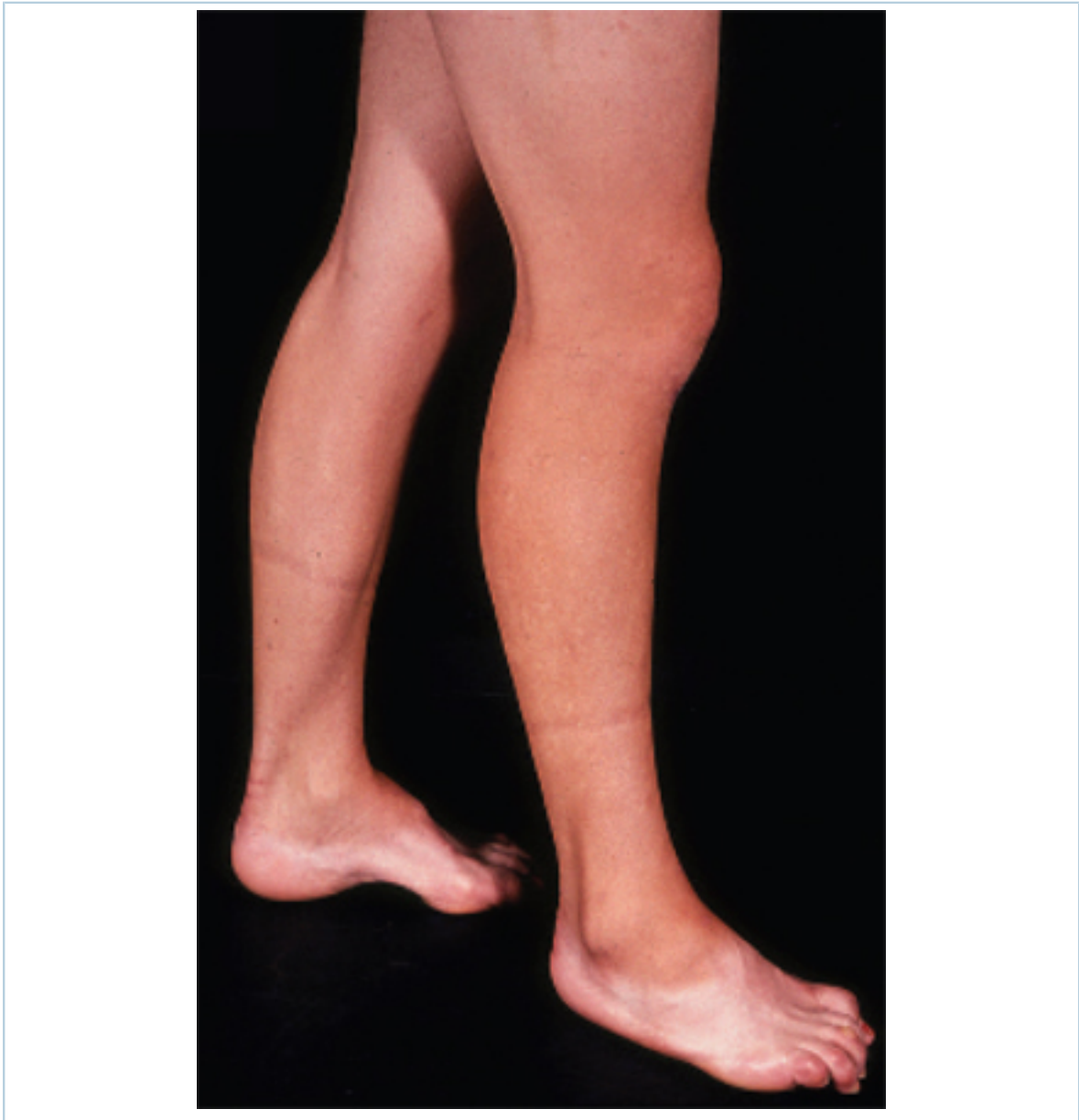
Pes cavus, toe clawing, and bilateral peroneal muscular atrophy in patient with CMT1A Adapted from Berciano J, Gallardo E, Garcia A, et al. Charcot-Marie-Tooth disease type 1A duplication with severe paresis of the proximal lower limb muscles: a long-term follow-up study. J Neurol Neurosurg Psychiatry . 2006 Oct;77(10):1169-76