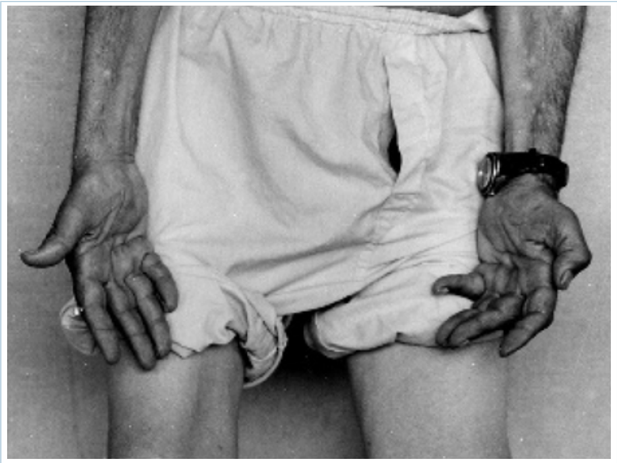
Wasting of hand muscles in patient with CMT1A

Adapted from Berciano J, Gallardo E, Garcia A, et al. Charcot-Marie-Tooth disease type 1A duplication with severe paresis of the proximal lower limb muscles: a long-term follow-up study. J Neurol Neurosurg Psychiatry. 2006 Oct;77(10):1169-76