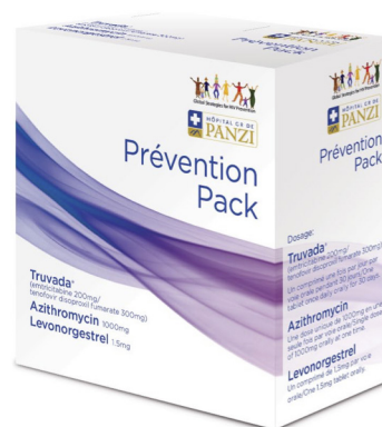
Figure 1 Prevention Pack.

We designed the Prevention Pack (figure 1), a pre-packaged post-rape medical kit. The following medications were included in the carton: (1) emtricitabine 200 mg+tenofovir disoproxil fumarate 300 mg to prevent HIV infection, 30 tablets, to be taken orally once daily for 30 days; (2) azithromycin to treat STIs, 1 g tablet, one-time