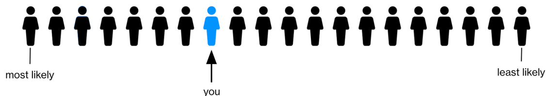
Figure 3 Illustrative example of a queue or ranking system for communicating cardiovascular risk.

We estimate you would move to 8th place.