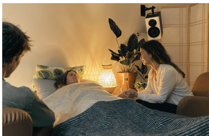
Figure 1 Mock-up of a dosing session in the test facility at neurobiology research unit, Rigshospitalet. Note: the individuals in the picture are not patients. Permission to use the picture in this publication has been obtained.

Each patient will be paired with two study personnel: a leading therapist and an assisting therapist. All therapists are mental health professionals (psychologists, MSc psychology students, medical doctors, MSc medical students and MSc music therapists) who have in depth knowledge of the psychopharmacology and mechanisms of action of psilocybin and have gained practical clinical