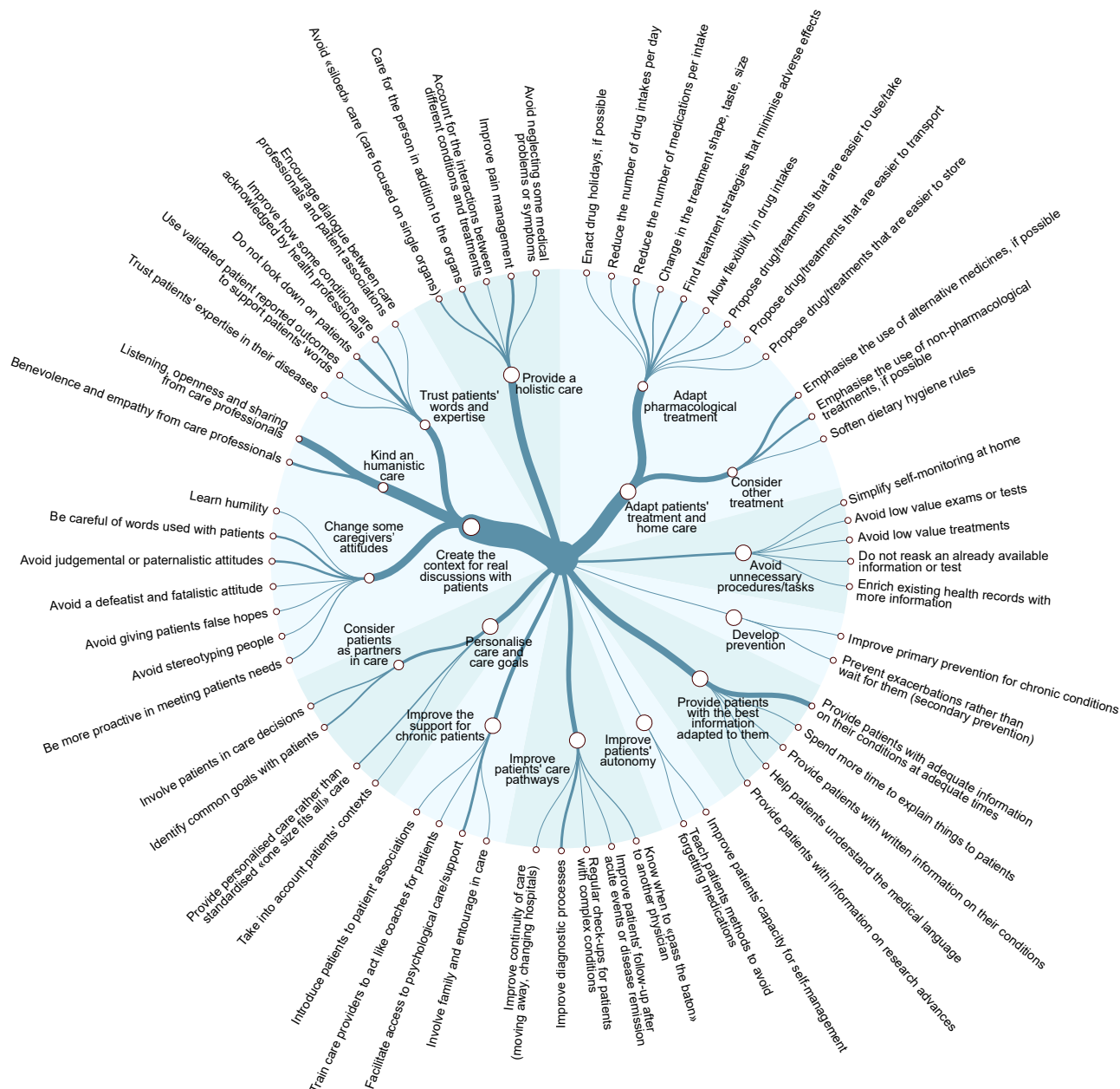
Figure 1 Areas for improvement at the consultation level. Line thickness represents the number of participants who elicited the idea.

enact these changes. Patients' 'ideal' care was not very different from the models advocated in the medical literature. 35 Care for patients with chronic condition should be effective but minimally disruptive. 36 Professionals should work as teams and coordinate their efforts. 37 Care should be patient centred and have a holistic approach rather than be disease focused and fragmented. 4 38–40 Low-value exams and treatments should be avoided. 41 Our collective intelligence study generated practical ideas to get closer to this ideal.