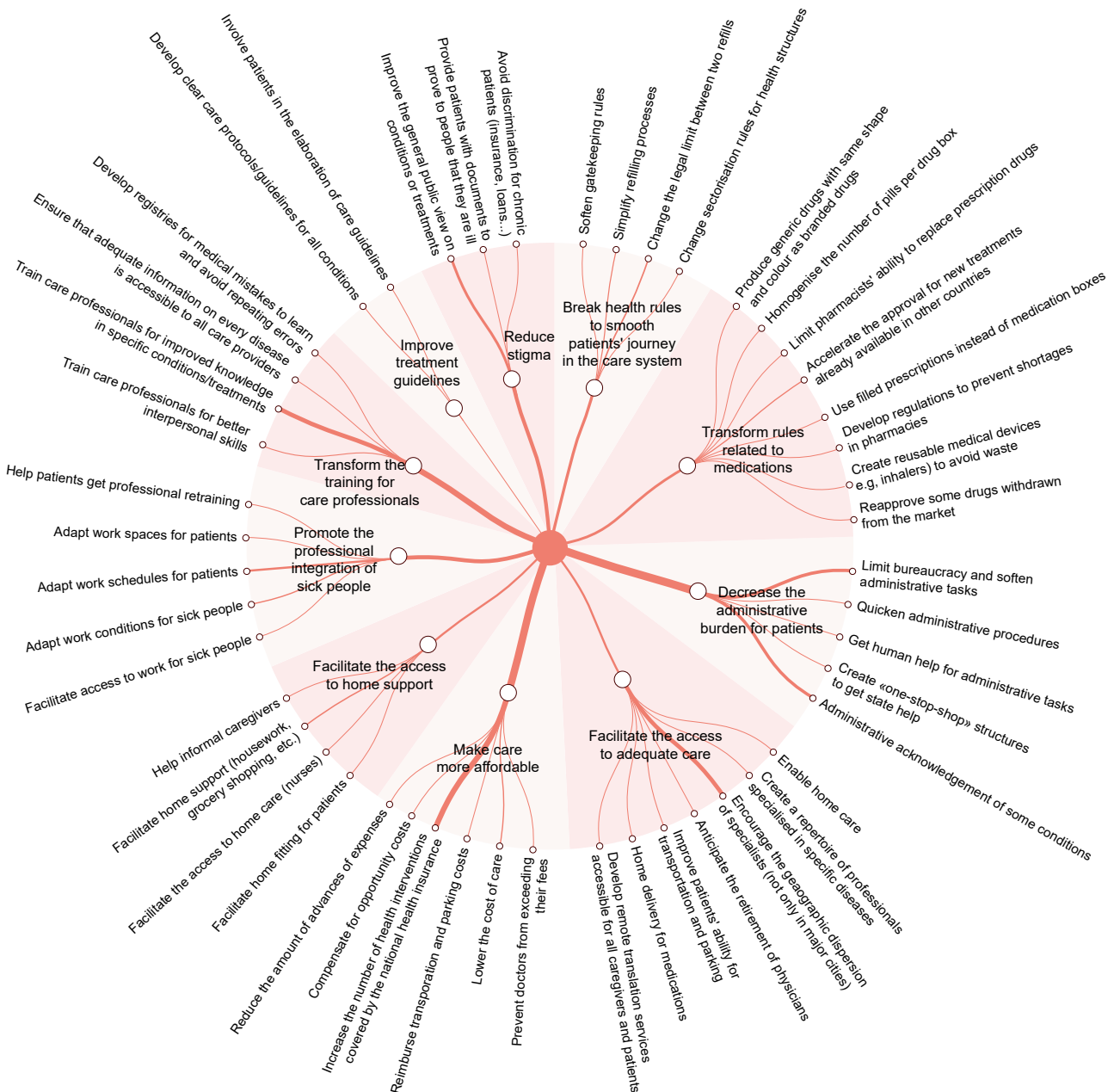
Figure 3 Areas for improvement at the health system level. Line thickness represents the number of participants who elicited the idea.

implemented on a larger scale to guide healthcare policies, although new tools to analyse larger and ever-growing amounts of qualitative data will be required. Although our results were at the small scale, they have already been taken into account by the French government in its consultations in preparation for elaborating the national strategy to transform the healthcare system. 57 Future steps may involve exploring how patients' ideas identified in this study would be prioritised or valued by different groups.